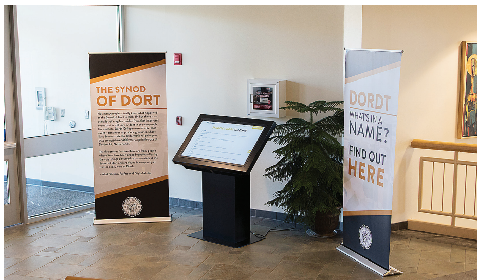
The “Dordt: What’s in a Name?” kiosk features a website that highlights videos of alumni and faculty explaining the history and influence of the Synod of Dort. To view the website, visit synod.dordt.edu .