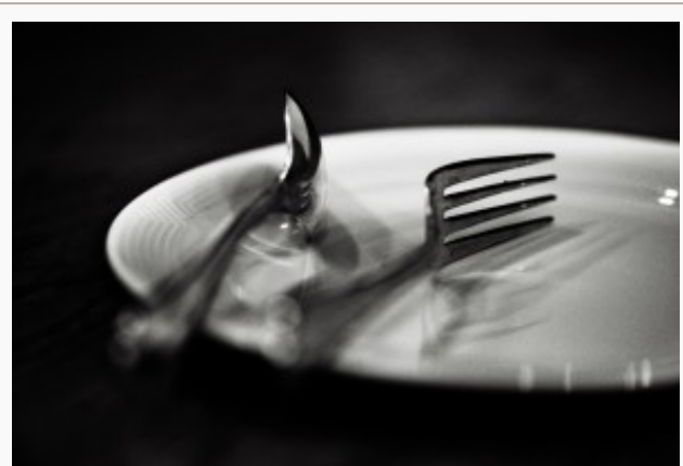
"Our Last Dinner" by Sippanont Samchai CC BY NC ND 2.0

Take, for example, the issue of what to eat for dinner. Such a banal, everyday thing seems, on its surface, to be quite simple. It is merely a question of me determining what I feel like eating, what I can afford to eat, and what is available to me to eat. These are all legitimate factors, but in the 'big picture' of creation many other things also come into play in the act of eating: what foods would be more or less conducive to me living a biologically healthier life? Culturally, what have I been brought up to find tasty (or comforting, or exotic, depending on my mood)? What is the social setting in which I eat my food? That is, in my moments of consumption, who do I eat with and how do I eat with them? Is eating an act of individual 'refueling,' a time of communal bonding, or something else? Is my food aesthetically appealing—does it look and taste good? What ecological responsibilities do I have in regards to what I'm eating? Do I have responsibilities to the people who labored to make my food or harvest it? Do I have responsibilities for how the animals that become my food are treated? Am I eating ethically, and who are the ethical parties involved: those who make my food (people only, or animals too?), those I eat with, perhaps even those I choose not to eat with? How do I show my religious beliefs through my eating? Do I pray and give thanks for the food? Do I eat in communion with others?