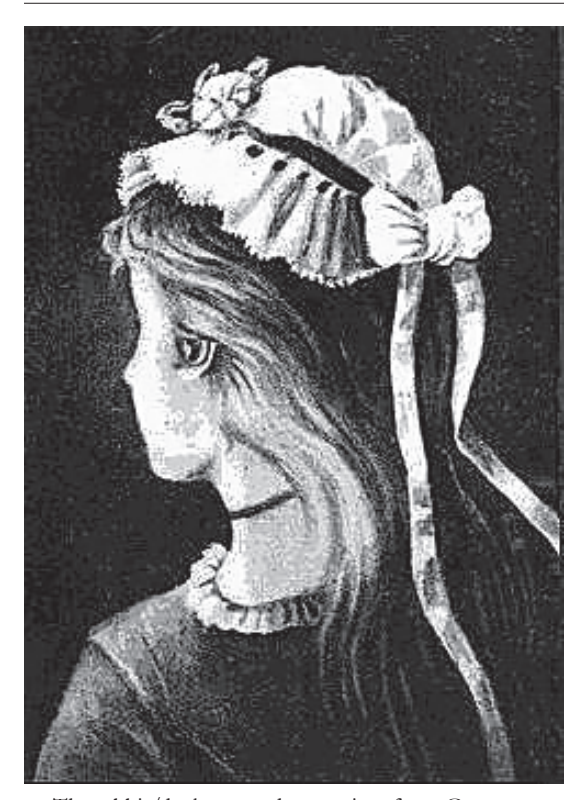
The rabbit/duck, a wood engraving, from Germany, is Kaninchen und Ente, published in Fliegende Blätter, 1939. The young woman/old woman drawing is from an unidentified German postcard of 1888, called "Junge Frau oder Hexe?" drawn by the English artist W.E. Hill, Punk magazine, USA, 1915.

been greeted with distrust and skepticism.