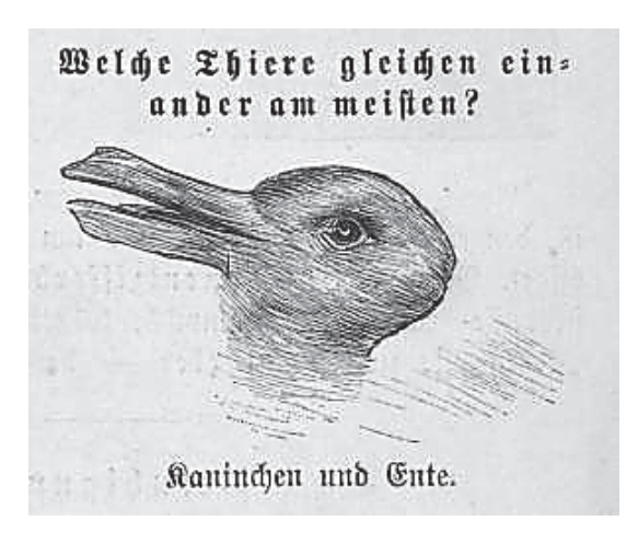
This is the original rabbit/duck wood engraving, Kaninchen und Ente , published in Fliegende Blätter , 1939.

valuable guide in sorting out what is (most likely) true. Recognizing that there is always one or another interpretive framework in play can be greatly instructive to us and lead us to deeper insight into ourselves, others and other communities.