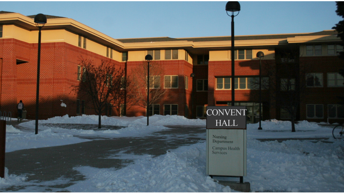
After the new housing changes, Covenant has been renamed.

Newly approved housing changes attempt to control the mixing of underclassmen sexes