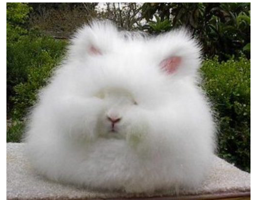
Talmidge McGooliger Columnist