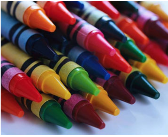
Color where you've never seen it before! Page 4