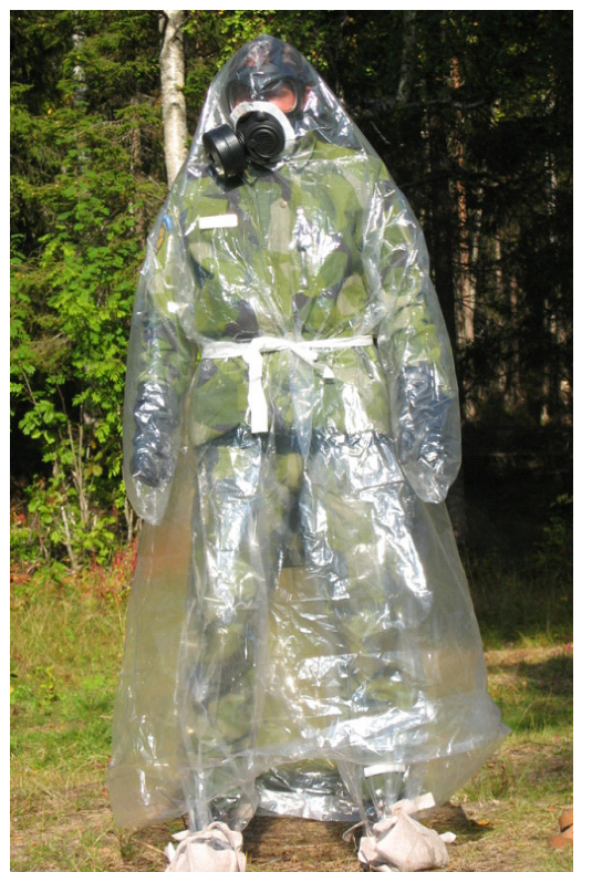
Health services recommends full body protection to prevent against the harmful effects of Swine Flu. Kevin Brouwer (above) finds the method "tedious, but ultimately necessary."

With these safety precautions in mind, students should be able to finish the flu season with as little illness as possible.