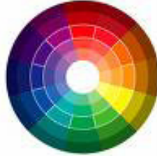
Right: Over there, we have colorful color.