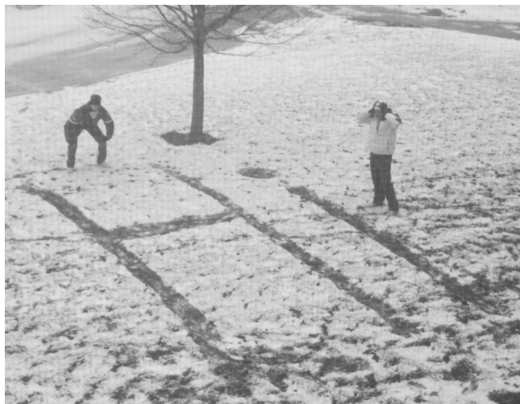
Confused students attempt to decipher the most recent message left in the snow outside Covenant Hall.