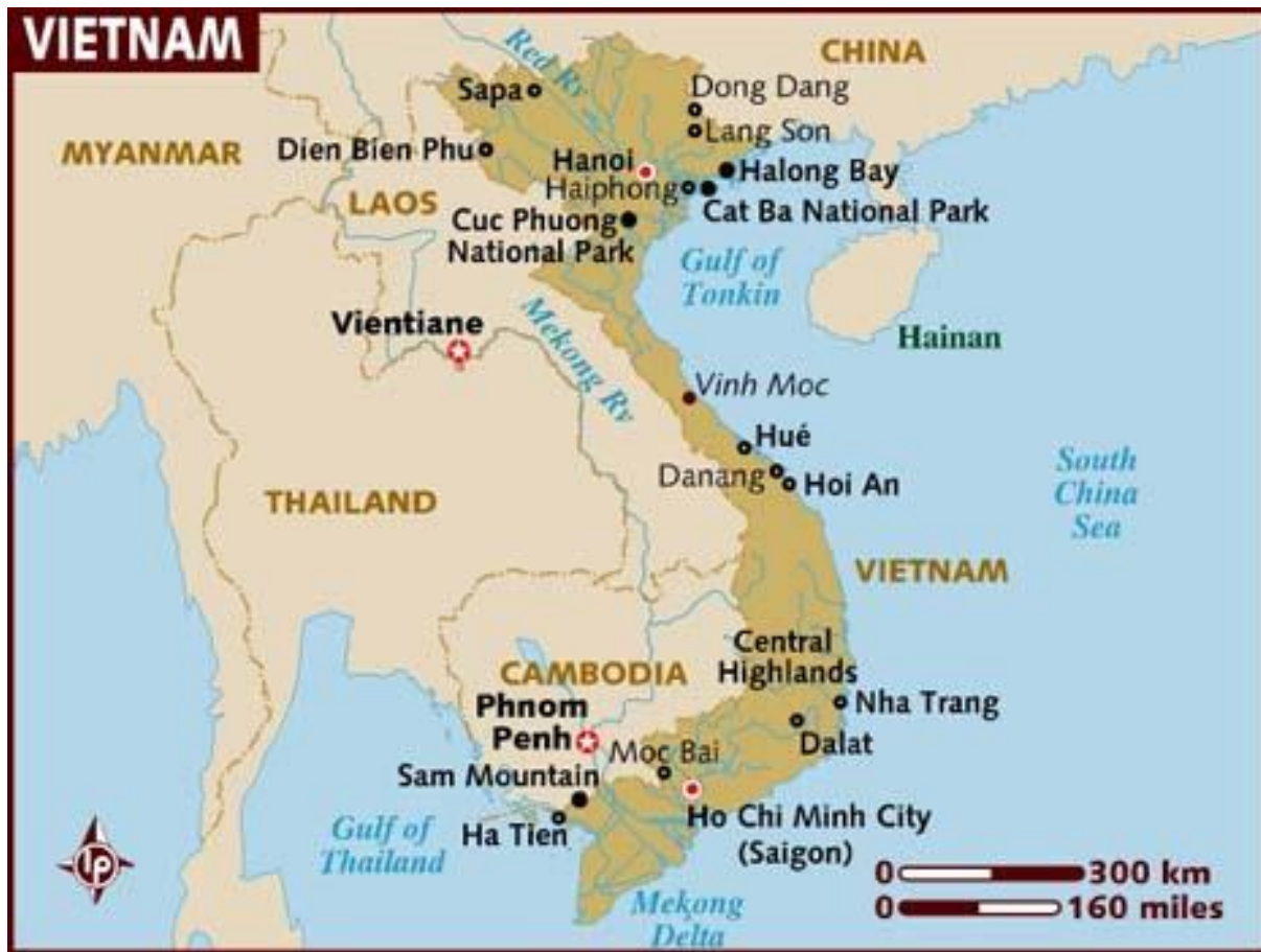
Exhibit 2 Construction Industry