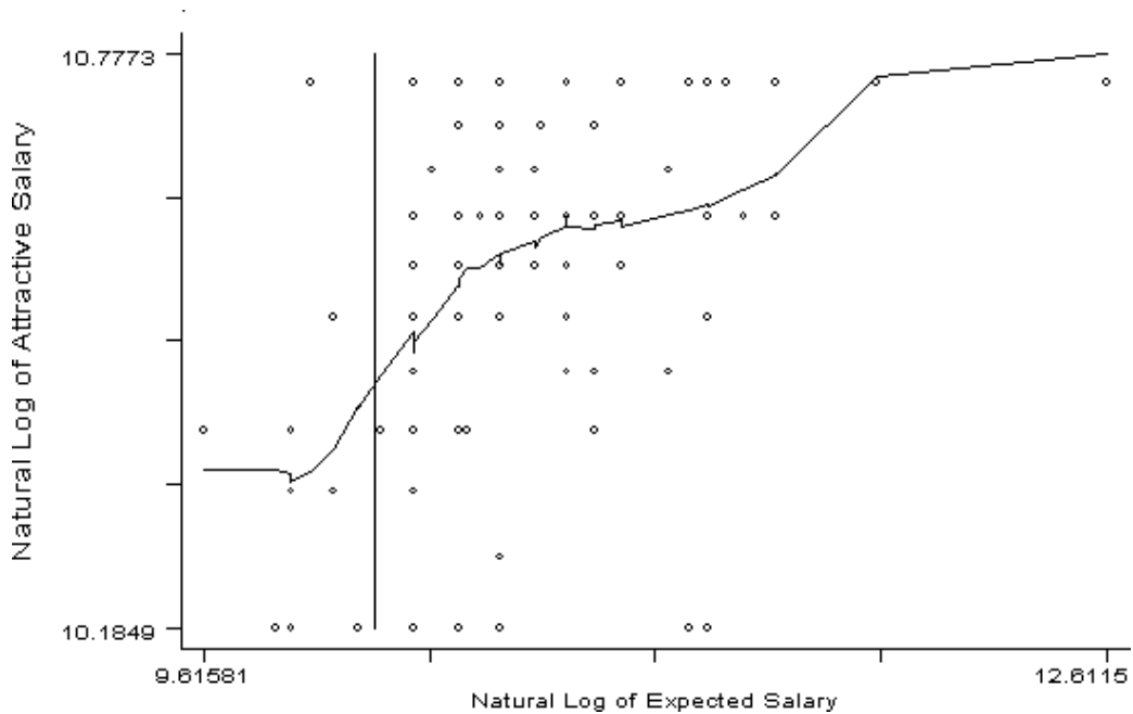
Figure 2. Relationship Between the Natural Logarithms of Expected Beginning Salary and the Teaching Beginning Salary Respondents Chose as Attractive – Sophomore Respondents

parallel to the Y axis is set at the value of the teaching minimum salary level. The “fitted” line is the lowest smoothing of attractive on expected salary. These figures show a relationship between expected salary and attractive salary that is not as simple as was expected.