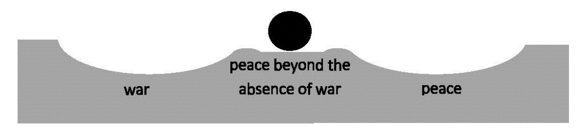
Figure 2. Peace beyond the absence of war as a plateau between war and peace.

The shallow basins in Figure 2 represent situations that are less resilient than the ones in Figure 1 above. Particularly the middle-state of "peace beyond the absence of war" is very shallow, meaning that rather small challenges or disturbances can push it across a low threshold either back to a state of war or into a somewhat more resilient state of peace.