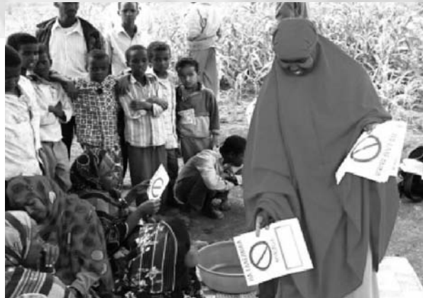
Mine Risk Education