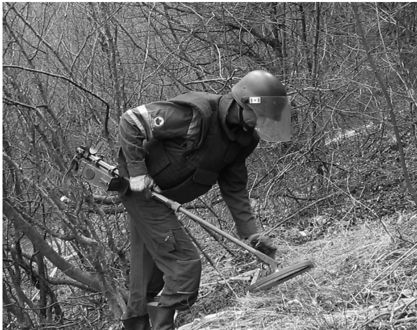
CIDC deminer using detector