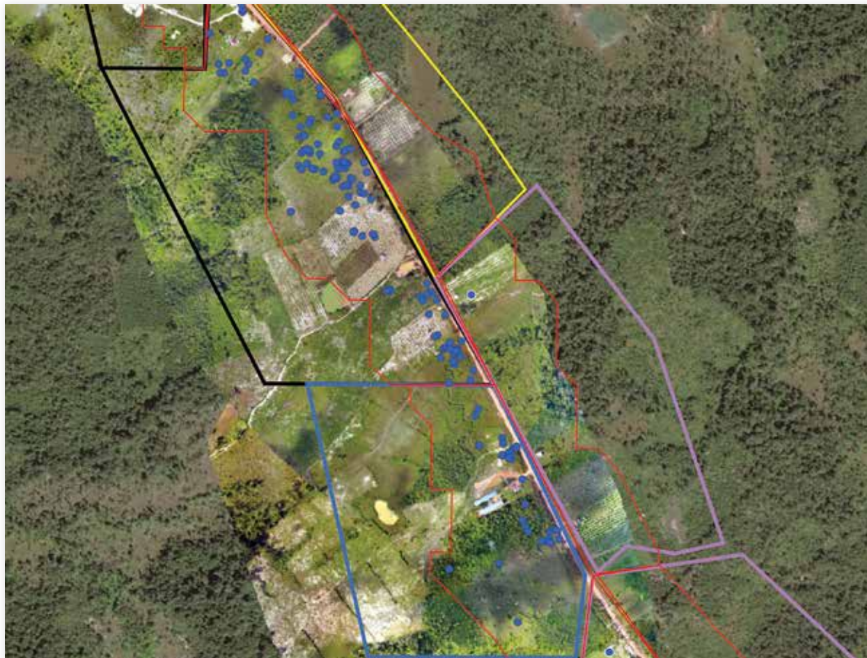
Figure 1. The same sites shown with UAV maps displaying updated high resolution images of the site where locals are using the land for farming and housing.