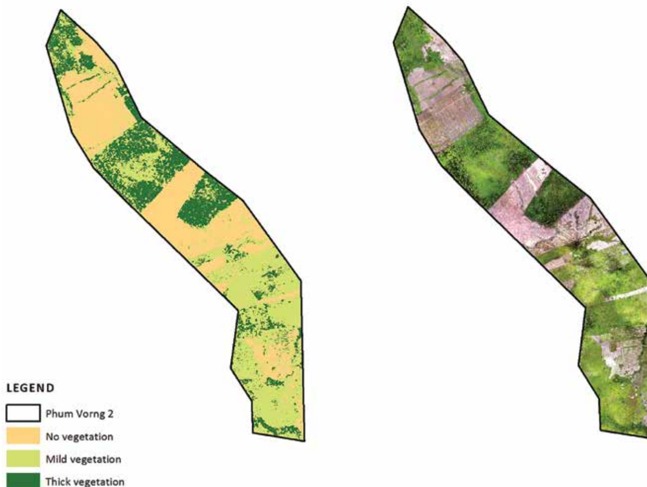
Figure 3. Sample drone images of a battle area clearance site in Northeast Cambodia where the UAV maps replaced the satellite base map and vegetation analyses, divided into three categories.

by UAVs. While feasible and a potentially useful development, this only really adds value if the specific detection capability itself is equal to or an improvement on existing manual, mechanical or animal-based detection systems from the perspective of safety, quality or efficiency.