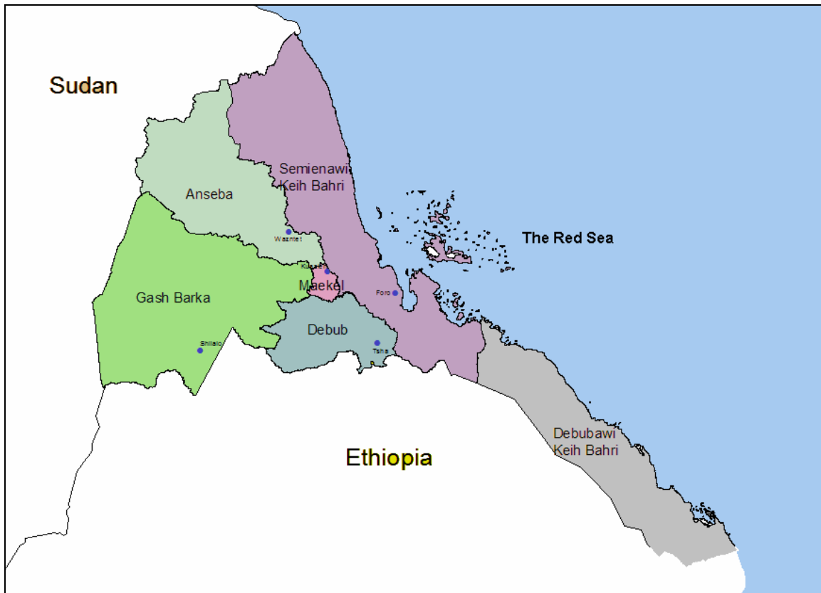
Map 1 Five communities selected