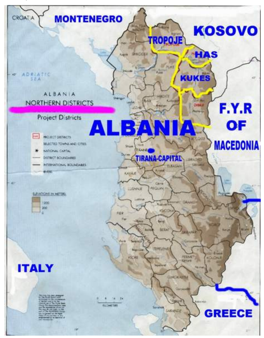
Figure 1 – Map of Albania