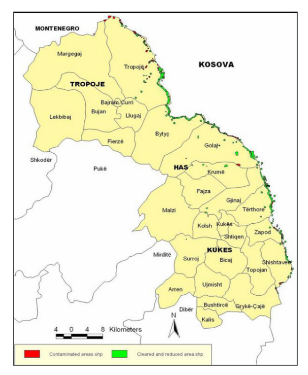
Figure 2 – Impacted Areas in Albania

Post conflict surveys in 1999 conducted by the Albanian Armed Forces and Care International determined that 39 villages with a combined population of 25,000 were impacted by landmines with an estimated area of 15.25km2. The landmine and UXO contamination spans 120 kilometres from the border with Montenegro in the north to the Federal Republic of Macedonia in the south with the majority of the contamination along the border with Kosovo and resulted in 34 deaths and 238 injured. The mine impacted area encompasses the Kukes region which includes the three districts of Kukes, Tropoje and Has. Most of the minefields are within 300-500 meters of the border. The map below indicates the mine impacted districts in northeast Albania.