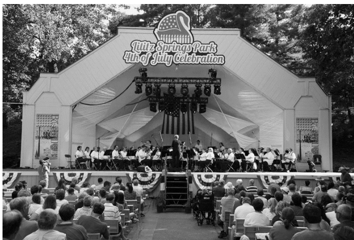
Figure 5. The Paul E. Beck Memorial Bandshell in Lititz, Pennsylvania

A larger example of this movement appears in the creation of Tanglewood, the current summer home of the Boston Symphony Orchestra (Figures 6 and 7). 29 Before a permanent structure became a topic of discussion, the people of Massachusetts began hosting summer concerts and festivals in 1934, which they held in a tent in the Berkshires, a rural region in the western part of the state. These festivals served as both a concert experience for local music lovers and as an opportunity for music education, as they featured both concerts and lectures by musicians. By 1936, the Boston Symphony Orchestra began to perform as part of this concert series and performed before an audience of 15,000. Later that year, a local family offered for their estate to become the new home of these concerts, a plot of land called Tanglewood. The next summer saw concerts again performed under a tent on this new plot of land, but the festival's organizers began making plans and raising money for a new permanent home for these concerts. On August 4, 1938, the newly completed outdoor concert venue opened for its