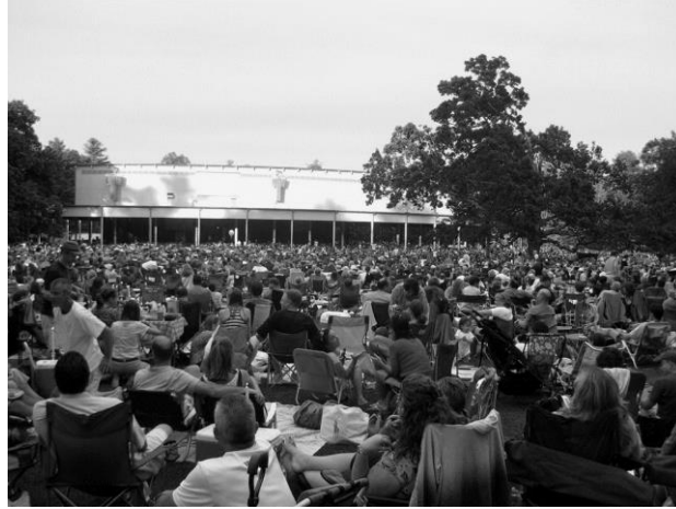
Figure 7. External view of Tanglewood in Lenox, Massachusetts

In Daytona Beach, the WPA created another bandshell, which they completed in 1937. Though the mayor of Daytona Beach initiated the project, the federal government paid for the majority of the structure's building costs and the workers for the project, with the city paying $84,000 and the federal government $184,000. While work was still in progress at the bandshell in 1937, the WPA completed enough of the project for the space to open officially on July 4, 1937. Made out of natural coquina rock, the designer, Alan MacDonough planned for the space to look like a natural element of the beach, while also standing out in order to bring attention to it. Featuring all of the latest technology available, the bandshell had a sound system installed by the Radio Corporation of America, which provided amplification throughout the venue and along the beach, as well as broadcasting concerts on the radio, all of which drew in large crowds. While the Daytona Beach bandshell no longer plays host to concerts, it still stands as a physical reminder of this movement and the work of the WPA. 31