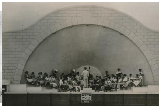
Figure 4. Bandshell in Stanton, Nebraska

season in what The Lincoln Star referred to as one of the best bandshells in the state (Figure 4). 24 Although these spaces brought about the ability for growth of music in many places during the Great Depression, not everyone was pleased with the work, particularly that accomplished by the WPA. 25