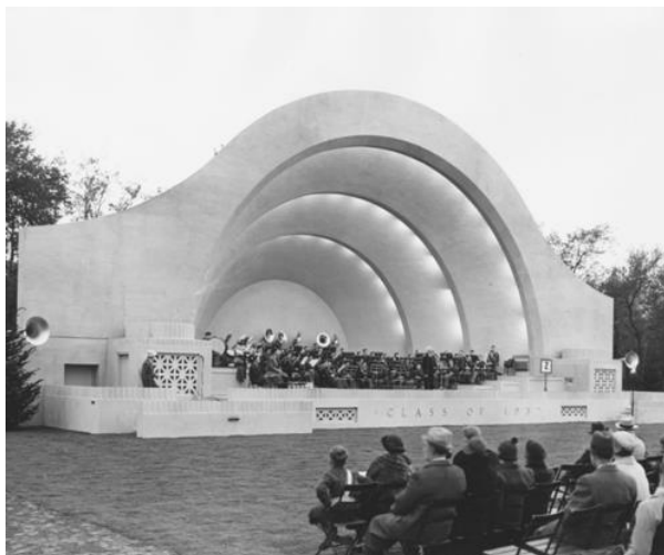
Figure 8. The former bandshell at Michigan State University in East Lansing, Michigan

A final example of the growth of bandshells during the Great Depression is the Michigan State University Bandshell, designed by O.J. Munson and completed in 1938 (Figure 8). 32 Together the federal government and the class of 1937 paid for this project, which cost $25,000 to complete, although again the federal government paid for the majority of this cost, with the donation from the class of 1937 totaling roughly $2,500. This bandshell, like many others at this time focused on drawing in large crowds of both the college community and beyond with many concerts. It hosted concerts of the Michigan State College Band on the open-air stage along with college events such as graduation and pep rallies. Eventually, the University demolished this bandshell in 1960 to make space for a new hall, though they commemorate the space on their online archives and through a plaque outside the new building. 33