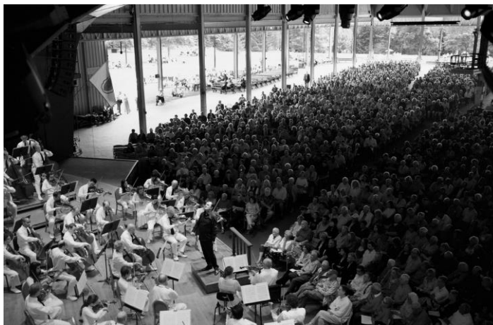
Figure 6. Internal view of Tanglewood, located in Lenox, Massachusetts

inaugural concert. For that first summer season alone, the Orchestra anticipated audiences of more than 30,000 for the festival, with the new concert structure seating 5,700. The festival planners also anticipated a diverse audience, as the Hartford Courant reported, “The six audiences will be...among the most cosmopolitan ever assembled for a similar event in America. Ticket holders already represent most of the states, and a number of foreign countries, and the advance interest had been so great that on some days since the shed was opened...as many as 1500 people have visited it.” A later report that summer reveals the concerts received even larger audiences than anticipated, with crowds reaching maximum capacity for the space. This shows the appeal these concerts and this space had for both the local music-lovers and those from across the country, as people traveled great distances to hear the Boston Symphony Orchestra perform at Tanglewood. 30