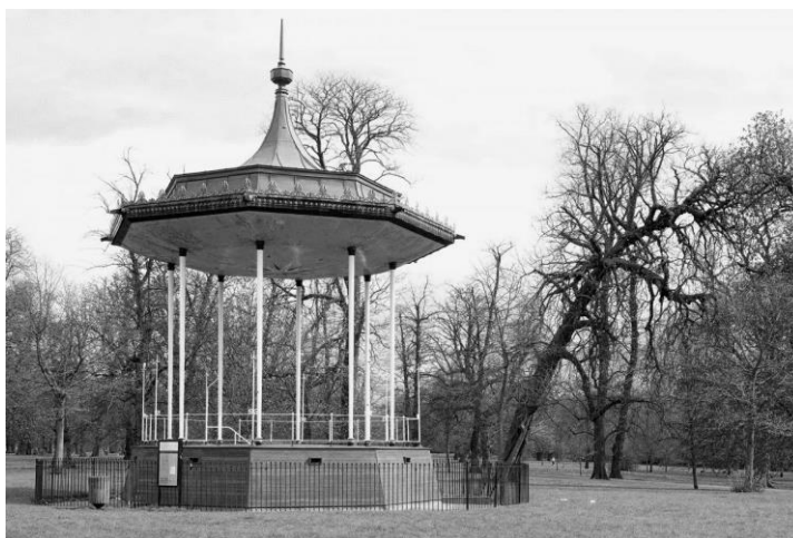
Figure 1. Bandstand at the South Kensington Gardens of the Royal Horticultural Society in England

designated for music and its performance in parks. With such an area, the structure of the bandshell and bandstand came to fruition as a dome-shaped building in order to project the sound of music throughout any given space without the need for artificial amplification. The shape and decoration of bandshells and bandstands also came from inspiration abroad, specifically from India, which had recently become a part of the British Empire. Particularly, the shape comes from the chatri , which has a similar form, featuring a dome and pillared pavilion, to Indian and Islamic buildings. The popularity of this building and its potential for changing the interaction between people and parks was