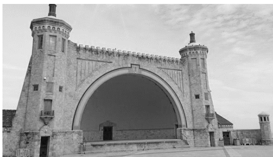
Figure 3. Bandshell at Daytona Beach, Florida

nation. In 1937, work finished on the bandshell in Daytona Beach, Florida (Figure 3), a two-year, $300,000 effort on the part of WPA workers. 23 This structure also featured an amphitheater with seating for 5,000 people for the numerous concerts planned for the summer and winter. The WPA completed many of these projects, another of which they built in Stanton, Nebraska, where the local concert band completed their 1936 summer