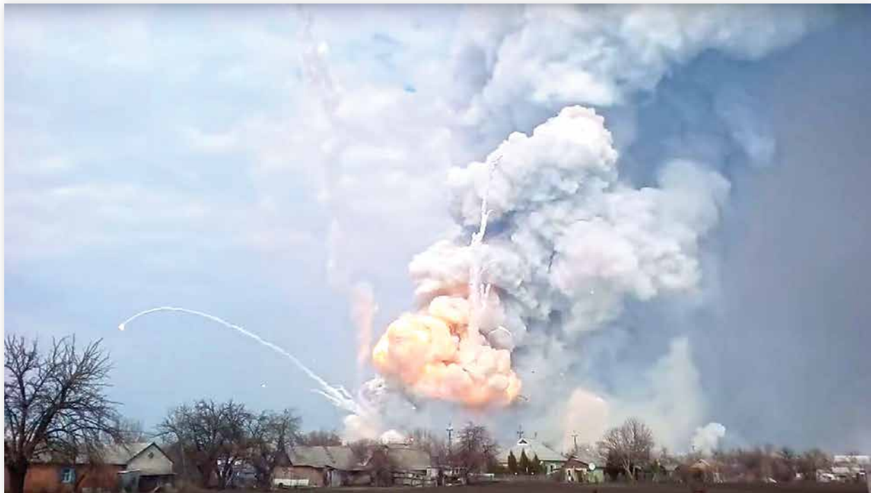
The terrifying scale of the blast of an arms warehouse that sparked a mass evacuation of 20,000 people in Balakleya, Ukraine, March 2017.