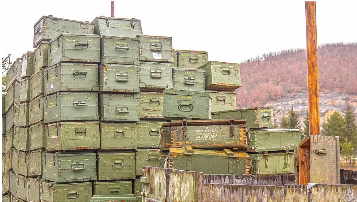
An example of an exposed, insecure, and potentially unsafe stockpile of ammunition in Kosovo.

Deliberate efforts are now needed to ensure that the various political initiatives do not duplicate one another. The U.N. General Assembly track has thus far prompted substantive exchanges on trends in diversion and on the provision of technical assistance and capacity building, thereby clarifying current gaps and possible remedial actions concerning ammunition safety and security. Concurrently, the rather regional and more 'operational' SSMA initiatives of Switzerland and the A.U. could be harnessed to complement and enhance the General Assembly platform.