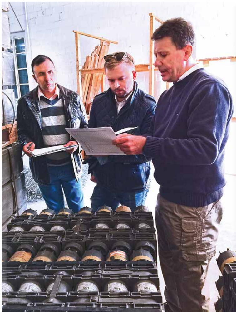
GICHD Ammunition Safety Management training, Switzerland, 2015.

required across state institutions on the accountability of the state for ammunition management. Sensitizing and involving oversight bodies such as parliaments could be considered to that effect. Moreover, national commitment may need to be nurtured from the top all the way down to the keeper of a local ammunition store. To do so effectively, trust building over time is essential and presupposes a long-term partnership with international stakeholders.