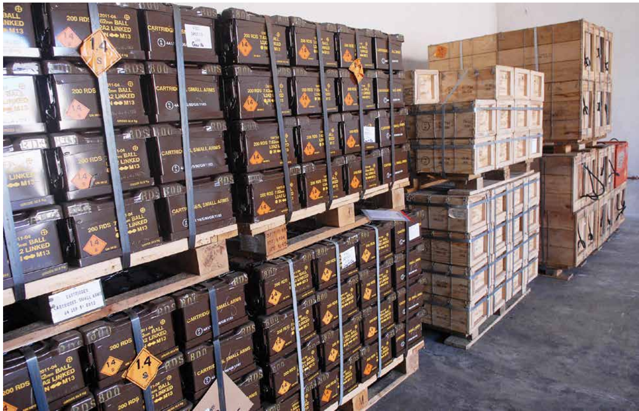
A good example of an ammunition depot: ammunition warehouse ASP 7 (Ammunition Supply Point 7), Italy.

treaty-related international cooperation and assistance. 11 It remains to be seen how ATT States Parties will concretely share good practices and report on effective measures taken to address the diversion of transferred ammunition. 12