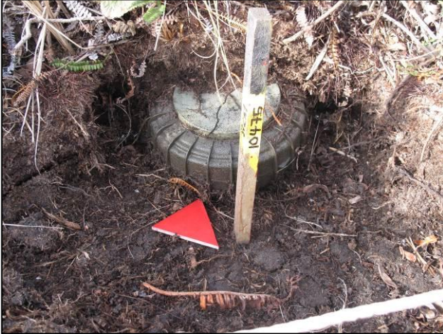
SB-81 mines were located and partially exposed by deminers, then recovered by CK

AT mines were located, identified and partially uncovered by the deminers, but left in place. CK photographed each mine in position before fully uncovering and lifting. The mines were then assessed to establish that it was safe to disarm them, and were defuzed inside the minefield.