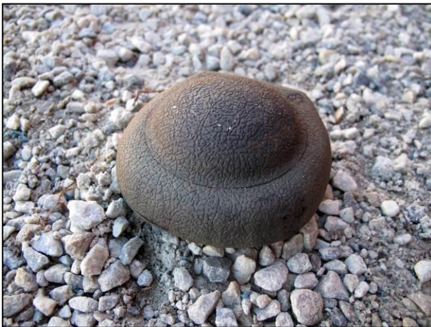
The rubber domes on the SB-33 mines have swelled and allowed some moisture to enter

Moisture was also present in most of the SB-81 mines, despite the integrity of the rubber pressure plate. The SB-81 fuze is actuated pneumatically, so the seal and flexibility of this plate are critical to its function; both aspects appeared to be unaffected in the mines examined 3