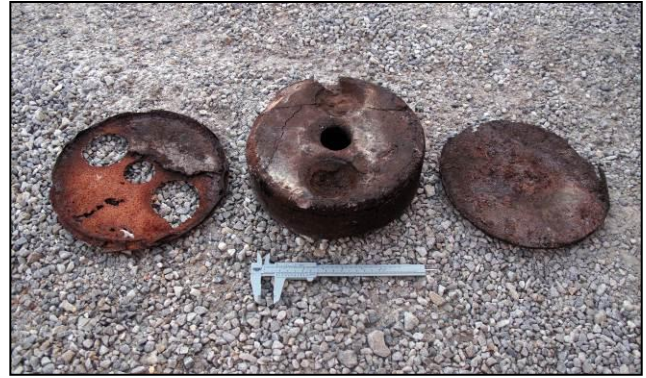
A 'new' mine type was identified