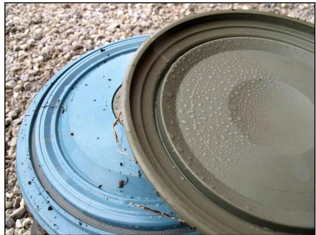
The pressure plates (right) of the SB-81 mines were in good condition; most were wet on the inside