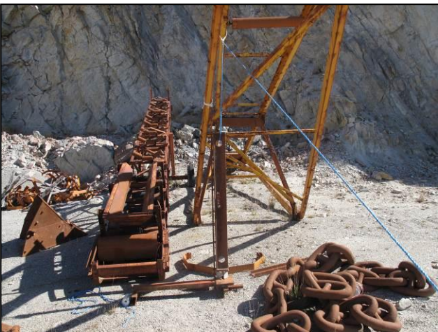
The explosive test rig used a rope and pulley to lower a girder onto the mine fuze

P4B fuzes, complete with detonators, were placed between two blocks for actuation. In order to test SB-33 and SB-81 detonators, SB-81 fuze mechanisms were reassembled and detonators attached; the assembly was then placed in an adapted SB-81 casing. The number of tests that could be conducted this way was limited because the fuze was destroyed each time a detonator functioned.