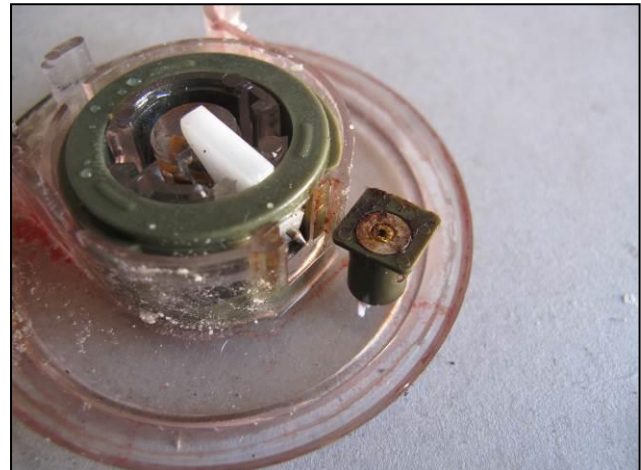
An SB-33 disassembled, showing the pin in the fired position and a hole visible in the detonator

A further 4 mines were recovered with no detonator plugs present. It was initially assumed that these mines had been laid unarmed, without plugs, but examination showed that all had been actuated.