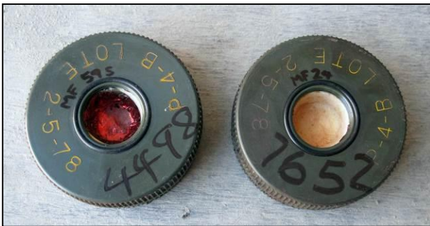
Variations in the foil covering the main charge

The foil is installed in the P4B body as a flat disc, but is broken when the fuze is fitted. In most cases, the foil ruptures in several places, creating 'fingers' that protrude into the fuze well. In some examples the foil remains virtually intact, while in others a portion is absent, but every P4B mine examined (including previous phases) has had some foil present.