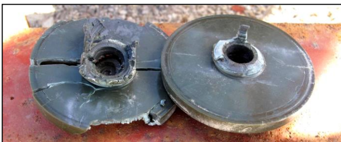
Results from P4B detonator testing. The fuze on the left was one of the few that detonated fully; the one on the right barely had the energy to break the housing and would not have detonated the main charge

Out of those that exploded, the majority produced a weak effect that would probably fail to propagate to the main charge. In other words, actuation of mines in this category would be unlikely to cause injury.