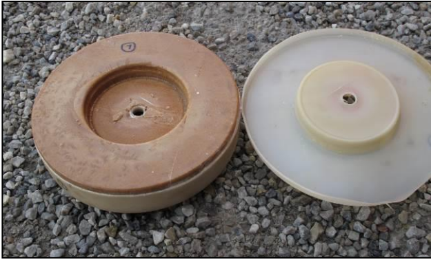
SB-81 charge were retained for demolition