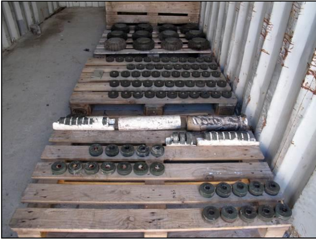
Storage of recovered mines