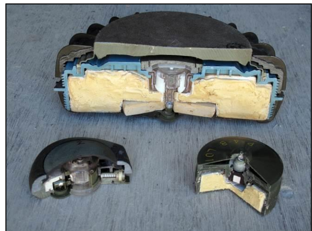
Sectioned models were made for each mine type