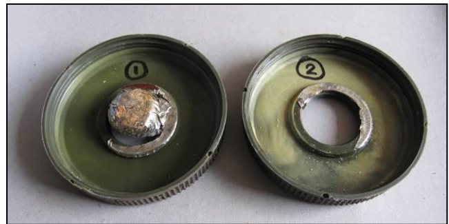
View of the foils from the inside of the casing