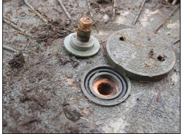
AT mines were examined and then defuzed in the minefield. The condition of detonators was noted