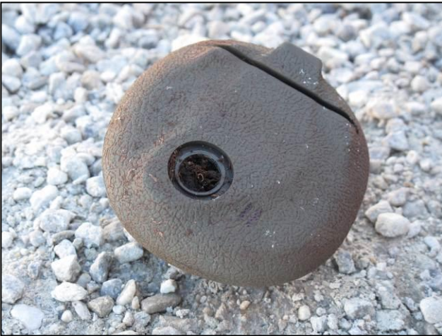
Several SB-33 mines had detonator plugs missing and were initially assumed to be unarmed