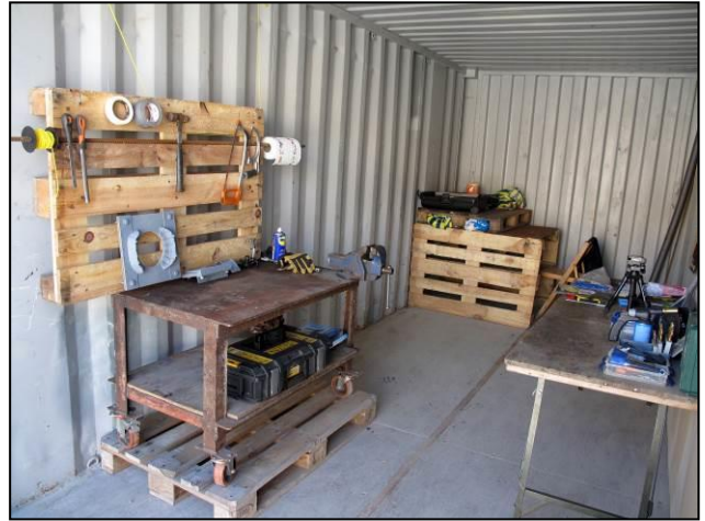
The APB was basic but functional

The following sequence of events was then followed ( Annex B ):