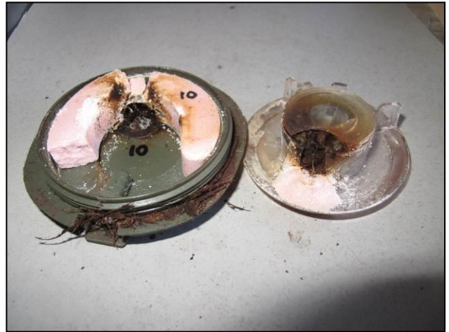
Examination revealed that the detonators had exploded, but failed to initiate the main charges