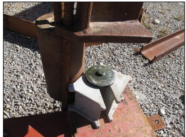
A P4B mine fuze placed on the test rig, ready for the girder to be lowered