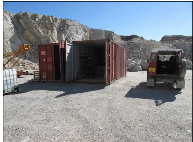
Explosive storage was in the left hand container, with the APB to the right

Two Iso containers were positioned side-by-side. One was used for the storage of recovered mines and fuzes (the assemblies being safely separated from one another). The other container was converted for use as an Ammunition Processing Building (APB).