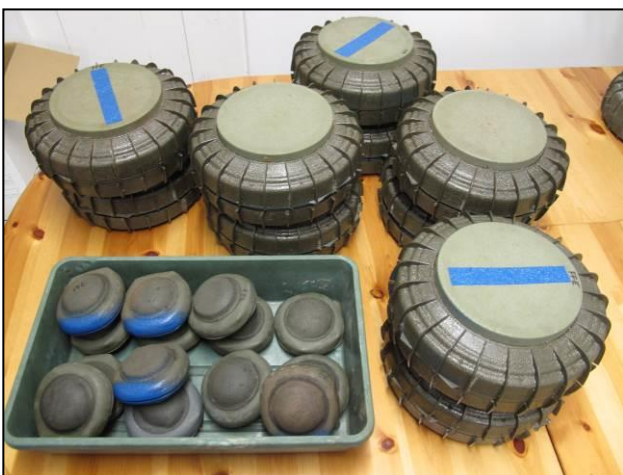
A number of mines were reassembled, inert ('FFE')