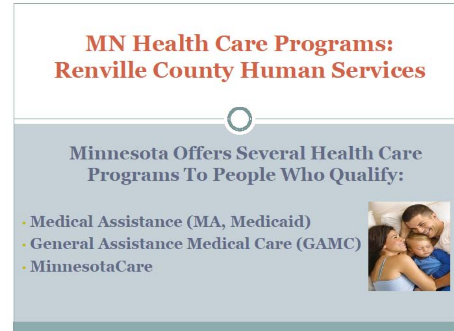
PowerPoint presentation slide 1 of 32