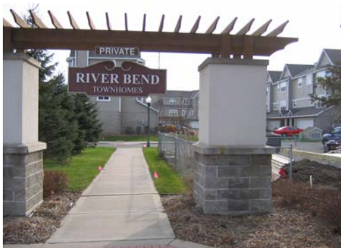
Example of Defensible Space (Chaska, MN)

New Urbanism is a quickly growing urban design among city planners and architects. Few studies have focused on New Urbanist design regarding crime; meanwhile, Defensible Space is an urban design which directly aims at preventing crime. This study has examined both New Urbanism and Defensible Space to find if there were any differences in crime rates between the two. Further research needs to be done to base a claim that either design actually causes crime.