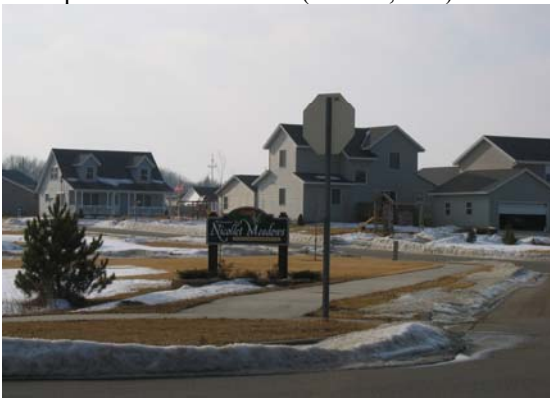
Example of Defensible Space (St. Peter, MN)