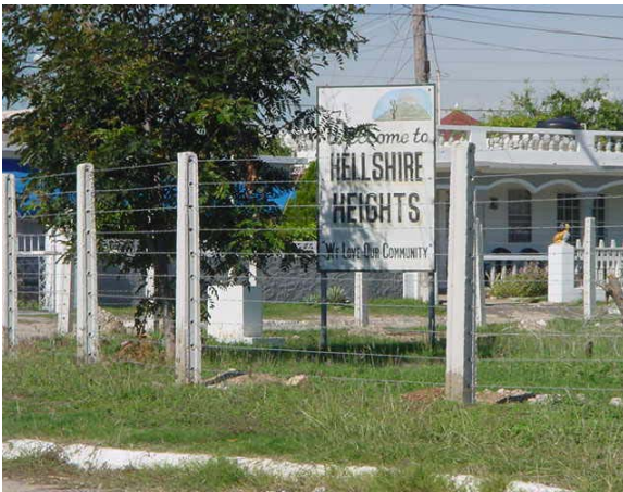
Example of Defensible Space

http://portbight.portlandbight.com/modules.php?&name=Ccam&file=community&op=modload&comm=14