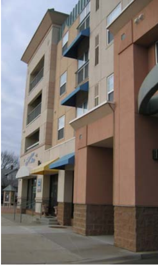
Example of New Urbanism (Chaska, MN)