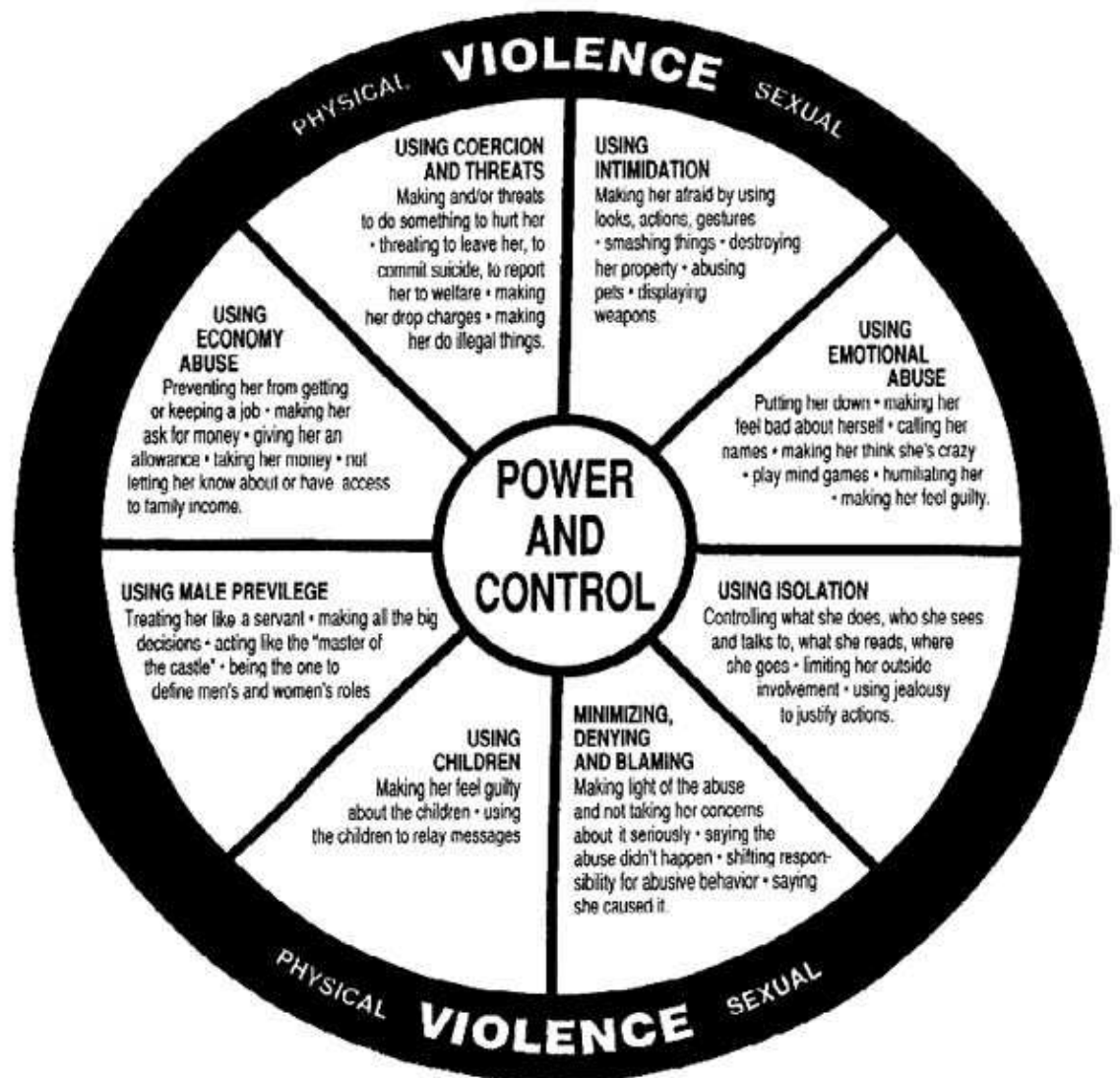
Figure 2.1 Domestic Abuse Intervention Project

This diagram is used to point out a model of the pattern of abuse and violence between individuals. Pence, one of the developers of the Duluth Model, stated that her program “assumes battering is not an individual pathology or mental illness but rather just one part of a system of abusive and violent behaviors to control the victim for the purposes of the abuser” (Pence, 1989, p. 30).