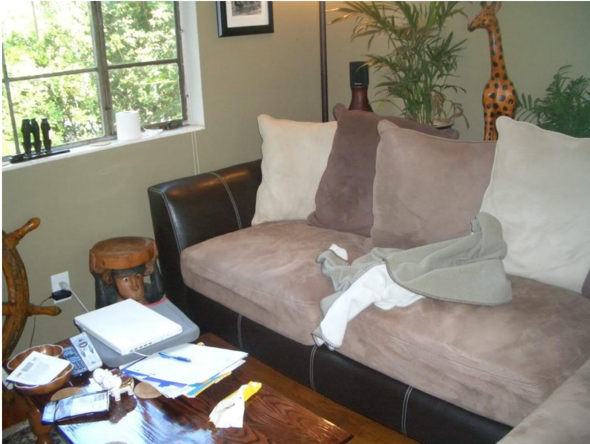
Photo diary photograph showing a laptop by a sofa as “favorite place to study and/or conduct research.”