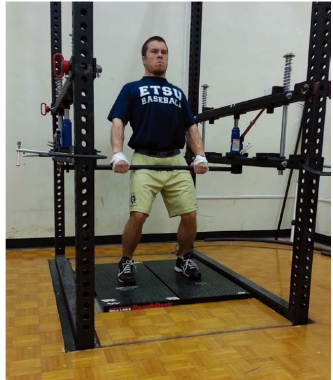
Figure 3 Photograph of isometric mid-thigh pull positioning on dual force plates.

The resultant percentage is termed the symmetry index (SI) and a PF symmetry index (PF-SI) score of 0% indicates perfect symmetry. 17-18 Data were processed using LabView 10.0 software (National Instruments Co., Austin, TX) and analyzed with PASW software (SPSS version 19.0: An IBM company, New York, NY). Pearson correlation coefficients were determined to assess the level of relationship between variables. Criteria for establishing strength of relationships were as follows: greater than 0.5 is considered large, 0.3-0.5 is