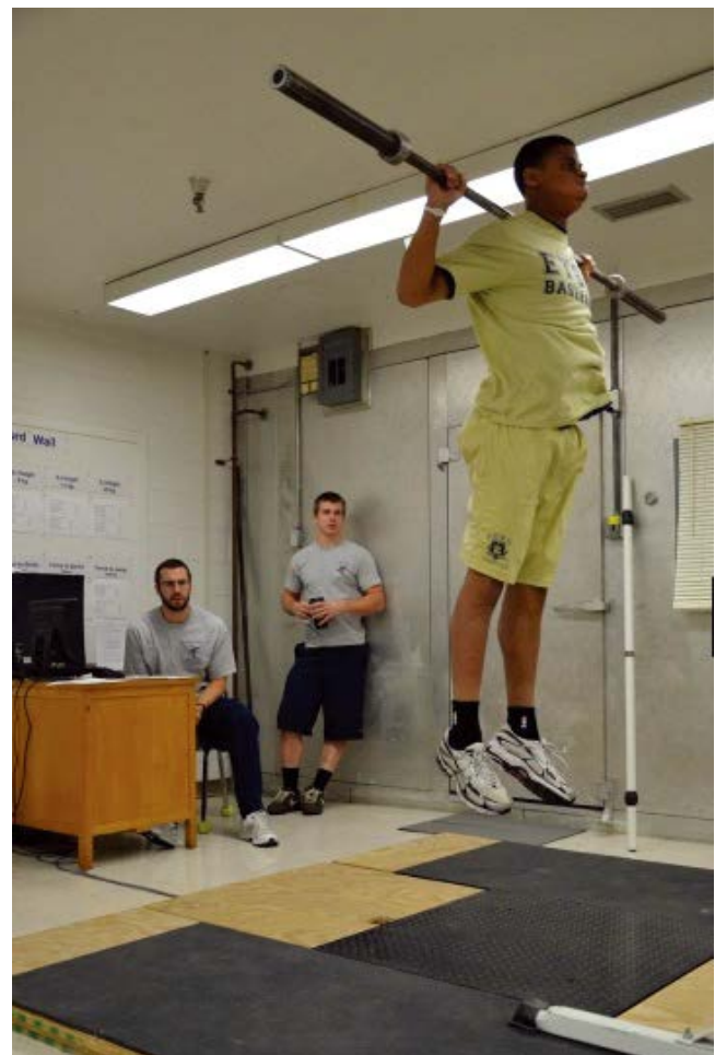
Figure 1 Photograph of a loaded condition (20 kg) of a static jump.

IMTPs were completed in a custom designed power rack, using a dual force plate set up (2 separate 45.5 cm x 91 cm) (RoughDeck HP; Rice Lake, WI) and data were sampled at 1,000 Hz. The apparatus and standard positioning were established based on previously published data from Haff et