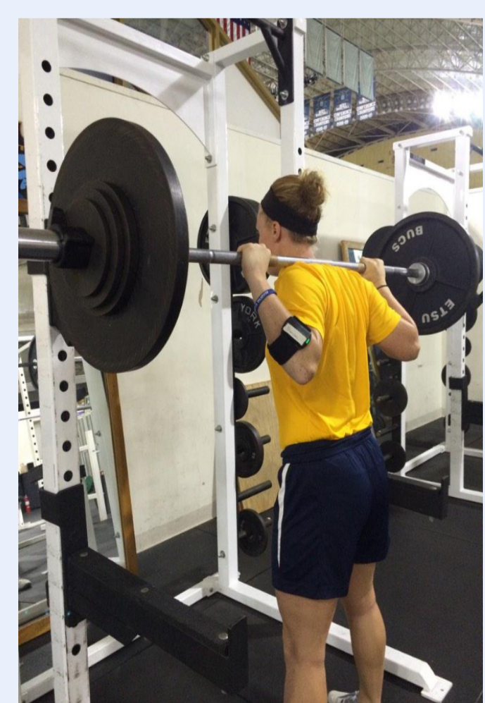
Figure 1a. Placement of PUSH™ band on the forearm.

This study specifically focus on changes and variation of bar velocity in relatively high repetitions. From a practical stand point, velocity variations would come from various factors such as acute fatigues, due to intensity (high percentage (%) of repetition maximum (RM)), technique, and training experience. A comparison of bar velocity changes at different intensities has been investigated before, but the same loads over repetitions also seem relevant and would provide practical knowledge to strength and conditioning coaches.