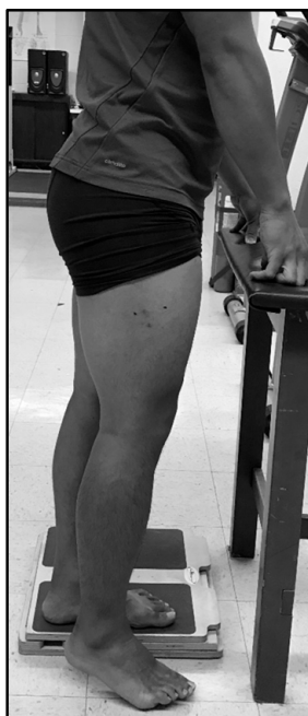
Figure 1. Standing ultrasonography collection position.

Following lying measures of LMT, LPA, and LCSA, standing measurements of muscle thickness (SMT), pennation angle (SPA), and cross-sectional area (SCSA) were collected. These methods were consistent with lying measures with one exception: for standing measures, the subject was upright and bearing weight on the opposite leg, which was positioned on a 5 cm tall platform, unweighting the measured leg and creating an internal knee angle of 160^\circ \pm 10^\circ (Figure 1). Three separate long-axis images and three separate short-axis images were saved for subsequent analysis, the same as were used for the lying measurements [9].