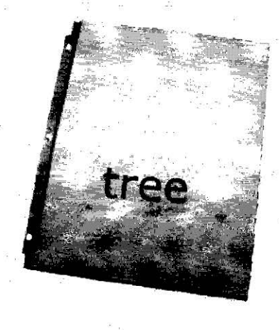
Photograph 2. Perforated page protector for reinforcement of visual memory

The strategy presented herein involves constructing an easy-to-use learning instrument that can reinforce memory through providing tactile involvement. The first step is to take an ordinary clear page protector and place it on a piece of corrugated cardboard from a box with the three ring opening to your left. Put a piece of paper into the page protector. Punch holes at about .25" apart over the entire surface using a push pin (Photograph 1). The cardboard will prevent damage to the desk/table surface. The paper in the page protector makes it easy to see where the holes have been punched. Pull the plastic sides of the page protector apart once you have finished punching holes, and you will have a rough surface on one side. Add a new sheet of paper to replace the one with the holes. The new sheet of paper provides a backdrop. Words or letters to be learned can be placed in the page protector (Photograph 2). The perforated page protector is ready for practice. If desirable, the perforated page can be conveniently stored in a three-ring binder.