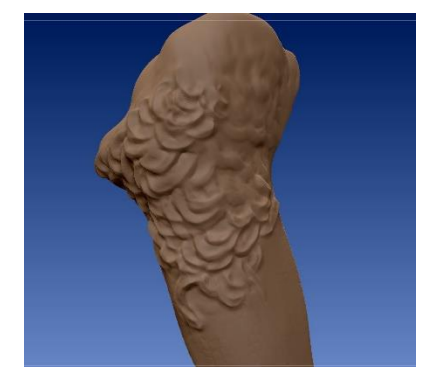
(Fig 4. Detail of feathers mid sculpt.)

Despite getting faster and more accustomed to the process I developed for each creature, the lizard-owl creature took the longest to sculpt. I have never tackled sculpting feathers before and wasn't yet sure how I was going to represent the textural elements. After the initial form was built I tested brushes on the surface attempting to achieve a wavy dynamic and layered buildup of texture. I first attempted the clay build up brush trying to sketch out the implied flow of the feathers. I later realized that the DamStandard brush could be used to provide the edges need to represent the texture but the texture still felt flat. I realized then that like drawing, each brush stroke needed to look intentional and show the depth like that of real feathers. Like hair, I realized that feathers each have an origin at the base of the skin and using that knowledge I could poke in and pull out the forms to a more believable level of detail.