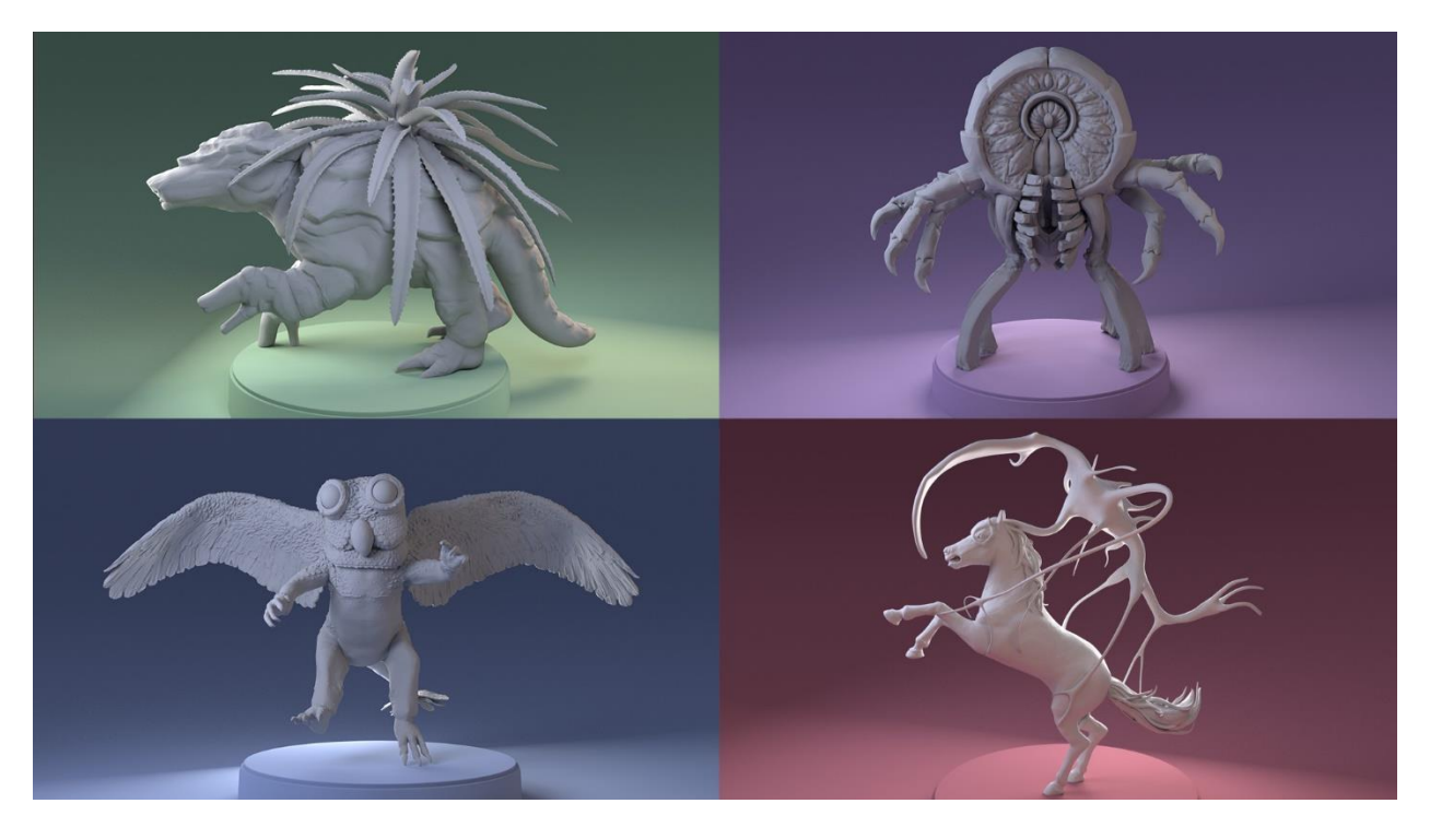
(Fig 6. Final Renders. Top left: Cactus Armadillo Creature. Top right: Parasitic-Bacteria Creature. Bottom left: Lizard-Owl Creature. Bottom right: Crab Mineral Creature.)

were focused on the sculpture while the fourth lit the scene. Some temperature was added to the lighted to keep the color dynamic.