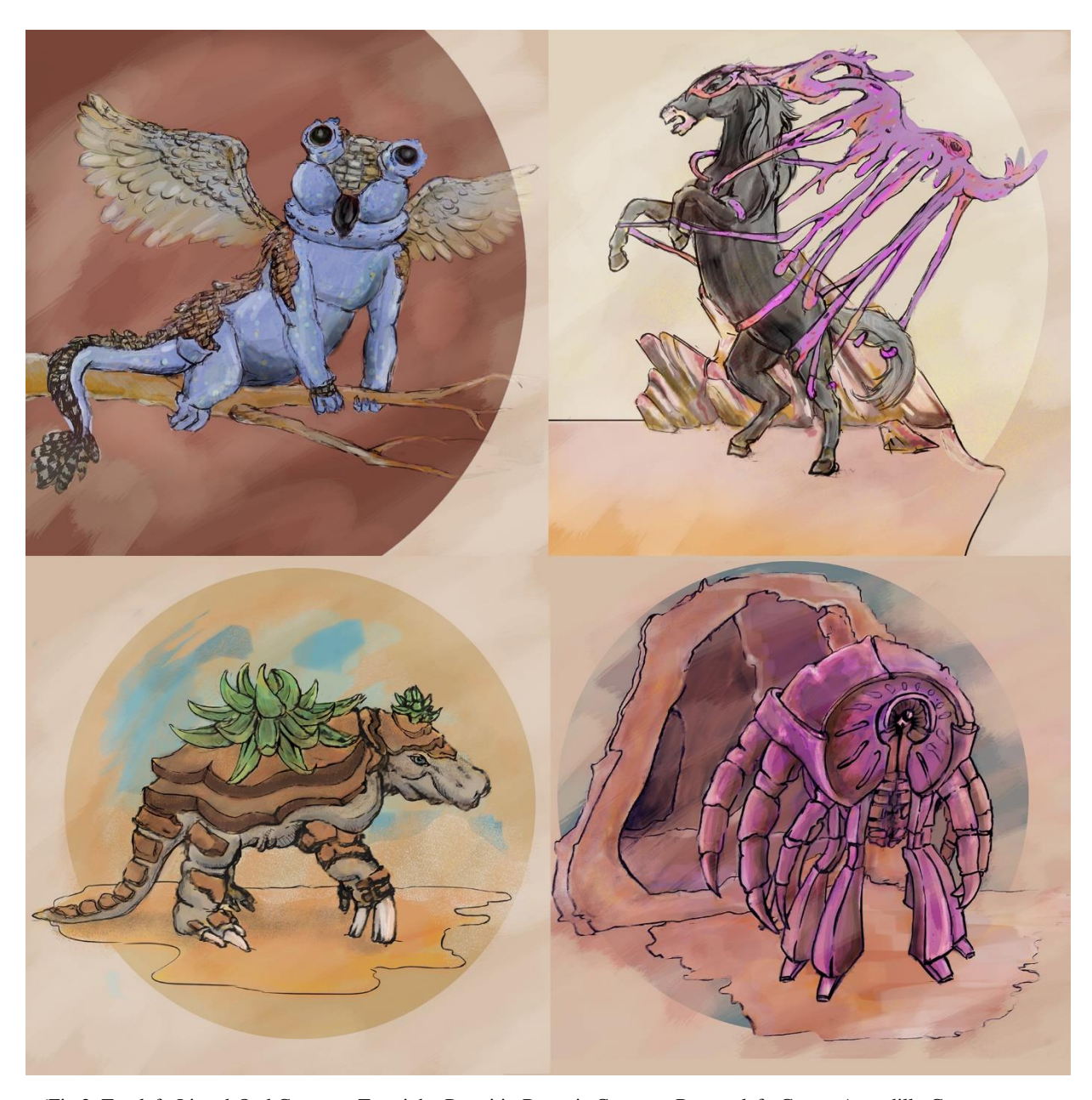
(Fig 2. Top left: Lizard-Owl Creature. Top right: Parasitic-Bacteria Creature. Bottom left: Cactus Armadillo Creature. Bottom right: Crab Mineral Creature.)