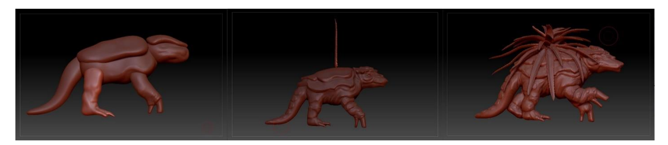
(Fig 3. Progression of sculpting the Cactus-Armadillo Creature.)

The next sculpt was the Cactus-Armadillo. For this creature I wanted the resemblance of it having sand on its back along with cacti to act like a type of camouflage. I ended up choosing desert succulents as the inspiration for the cactus. I created a single leaf and duplicated it out reshaping and resizing for each leaf to keep it organic and natural in appearance. My original plan for the pose was to have it mid eruption from the ground but I realized part way through the project that I was limited in time and did not yet have the knowledge to represent sand particles. I chose to create the pose matching its perceived mood and stood it as though the creature was in mid stride walking across the desert.