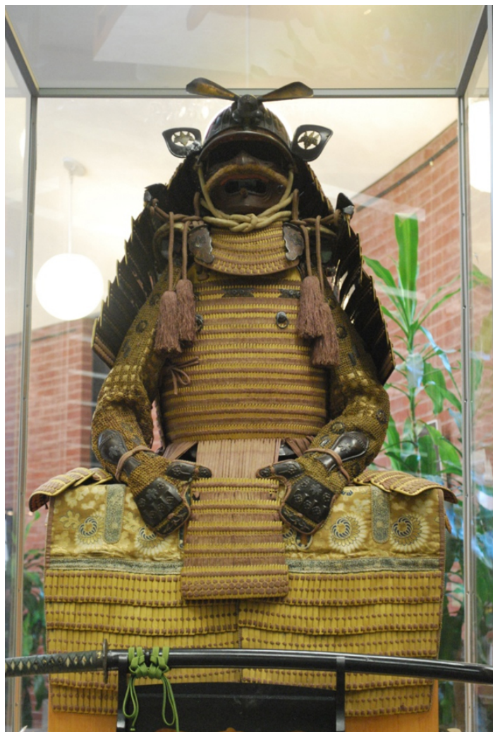
Samurai-Image for Thirty Treasures Booklet, 2011, Special Collections and College Archives, Gettysburg College.