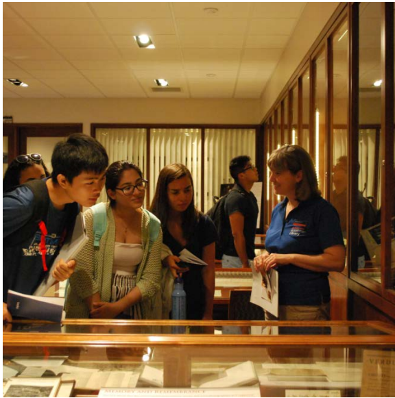
First-year students explore an exhibit in Special Collections & College Archives.

Gettysburg College is a four-year, residential liberal arts college located in Gettysburg, PA. The institution serves 2,600 undergraduates and welcomes a cohort of around 700 first-year students each fall. During the first week of classes, new students participate in an extended, campus-wide orientation called “Charting Your Course” (CYC), which includes both required and optional activities.