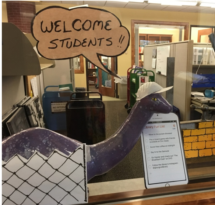
Technical Services welcomes first-year students