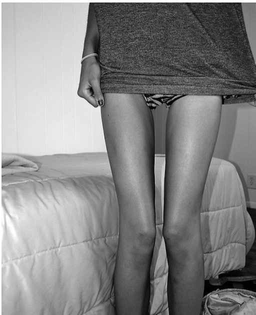
Fig. 3. Trigger. This is a public image that can be found under the Instagram account _e.u.n.o.i.a_ . This figure is an example of a trigger image that might show up under the hashtag thinspiration and could also be found in any of the other word variations. Below