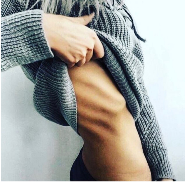
Fig. 2. Reverse Trigger. This is a public image that can be found under the Instagram account thelovelybones_ . This figure is an example of a reverse trigger image that might show up under the hashtag thinspiration and could also be found in any of the other word variations. Below the image there are usually different hashtags that describe the image or particular emotions.