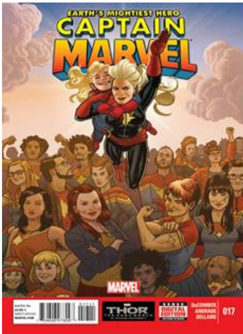
Figure 1: The cover of Captain Marvel vol. 7, #17 by Joe Quinones.

In issue 17 of 2013 Earth's Mightiest Hero: Captain Marvel , the citizens of New York City chant, "I am Captain Marvel!" to confuse a convoy of drones and save their beloved blonde heroine (DeConnick 28-30). Figure 1, the cover of this issue, shows a background of diverse people: male, female, gender fluid, young, old, different body types, and various races and ethnicities. Everyone is dressed like Captain Marvel, because they each embody a hero's strength. This image challenges the mythological trope explained by Campbell because it shows many different types of people embracing their inner hero. In figure 2, a young girl in Jersey City tapes up a picture of Captain Marvel and lifts her arm to show her Rosie the Riveter muscle swell and rip her sleeve. This young girl also seems to be embodying the spirit of Captain Marvel along with the whole of New York City. The reader never encounters this new character's face – only her backdrop, which signals the arrival of a new force.