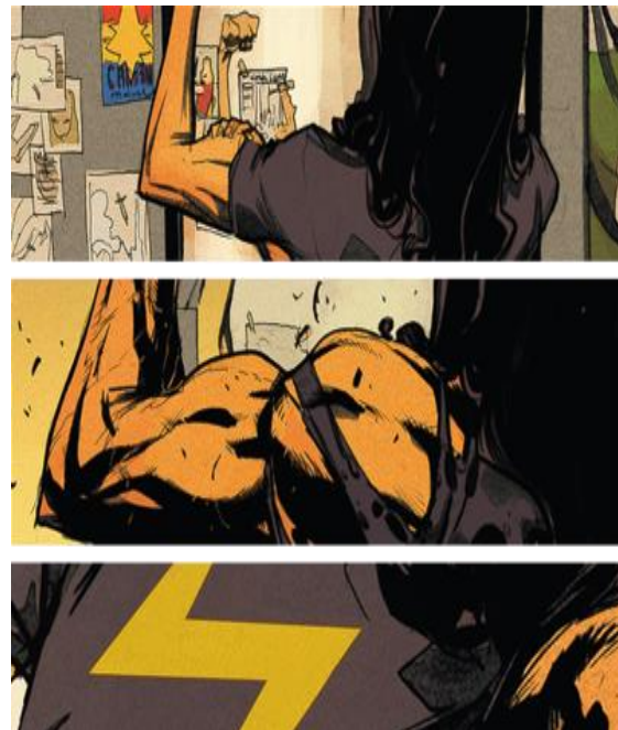
Figure 2: Picture of Kamala Khan in Captain Marvel vol.7, #17 (DeConnick 34).