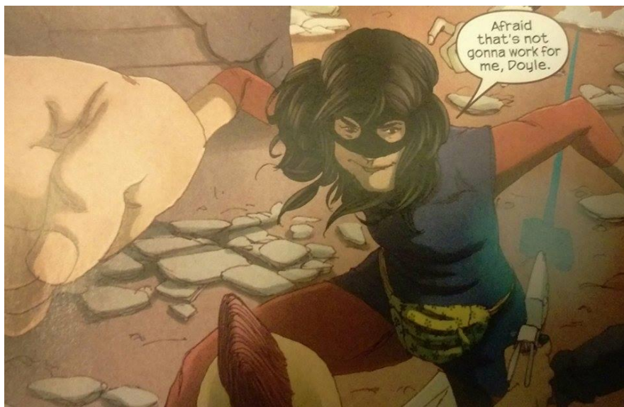
Figure 4: Ms. Marvel from Ms. Marvel: No Normal (Wilson 88).

Madrid states that women heroes like the powerful Storm are still upheld to supermodel standards to attract male readers. Storm simply has to strike a pose and point to use her powers: "For as mighty as X-Men's Storm is, she strikes a pose, extends a hand, unleashes a lightning bolt, and looks great. Just like posing for a picture in Vogue " (Madrid 292). Kamala is obviously not a pose and point character like Storm, as many panels in her series suggest.