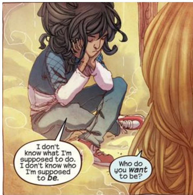
Figure 3: Panel from Ms. Marvel: No Normal (Wilson 19).

3, Kamala tells her super-powered guides that she does not know what she wants in life. She has rejected her religion and her family, and now all she wants is to be beautiful and strong like Captain Marvel. Wishing to be a hero, Kamala is granted her desire – but as Captain Marvel states, “‘It is not going to turn out the way you think’” (Wilson 18). Kamala wakes from her vision with Captain Marvel’s younger face and uniform and the ability to shapeshift her body in every way possible.