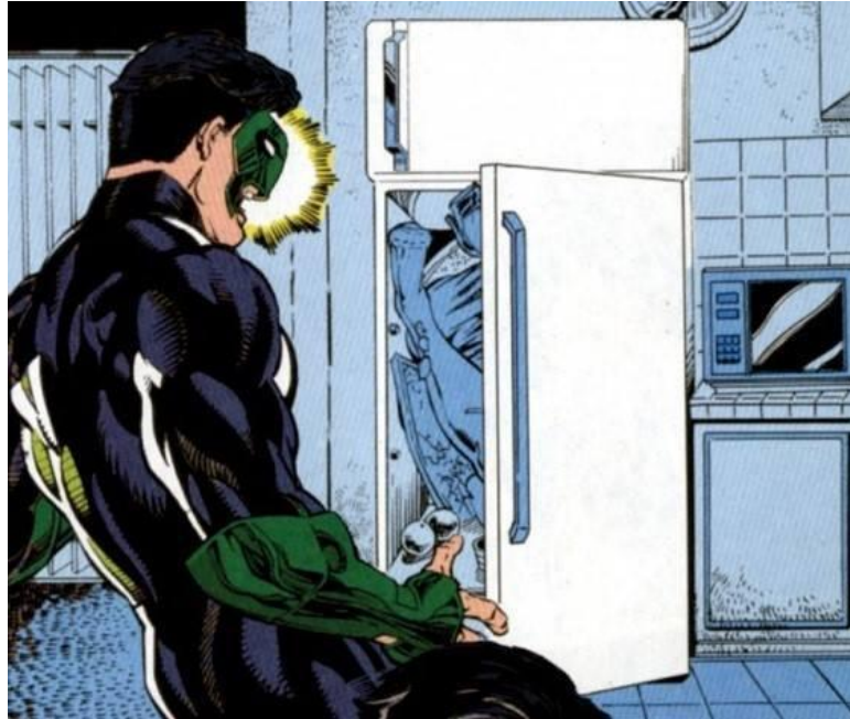
Figure 7: Green Lantern finds Alex Dewitt's body from Green Lantern vol. 3 #54 (Marz 16).

Women have often been used as objects to propel a male hero's story further. The pain inflicted on these women – whether through torture, rape, or death – becomes a major storyline that influences the male hero. Jennifer K. Stuller writes, “[The disempowerment of women in comics] is generally used for one of the three narrative purposes: shock value, as the initial motivation for a superheroine's quest and or/vigilantism (i.e., Red Sonja's rape), or more commonly, as the driving force of a superman's rage” (Stuller 144). As Stuller points out, women's disempowerment is a longstanding trope that is “abhorrent and persistent” (Stuller 144).