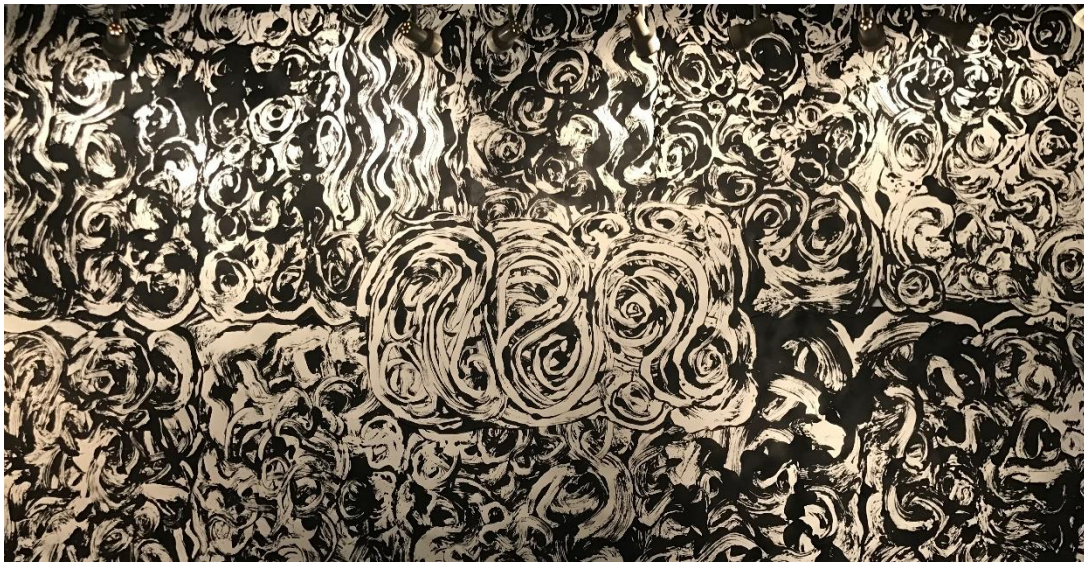
Figure 2: Slithering Through the Excrement of Time, 2017

In my piece, Figure 2: Slithering Through the Excrement of Time , I’ve used abstraction to evoke imagery that represents the idea of serpentine movement without rendering anything literally.