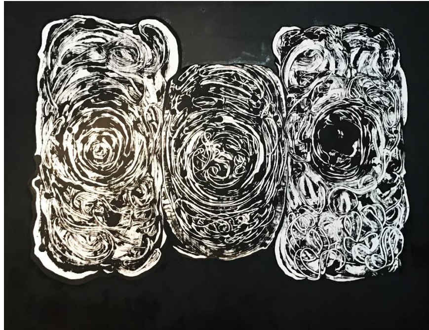
Figure 3: Three Husks

resemble trees, serpents, mountains, eyes, anthropomorphic figures, bones, and heaps or nests of organic matter like in my triptych seen in Figure 3: Three Husks .