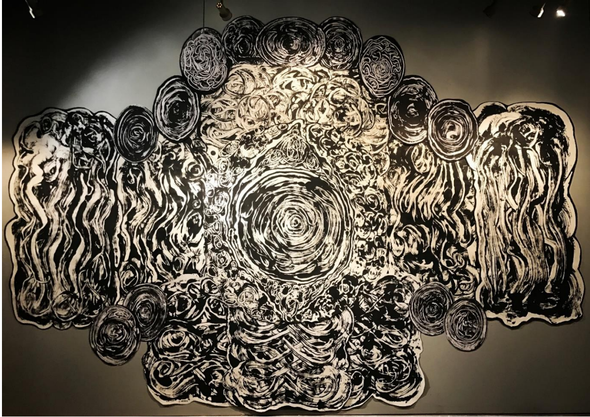
Figure 1: Tunnel