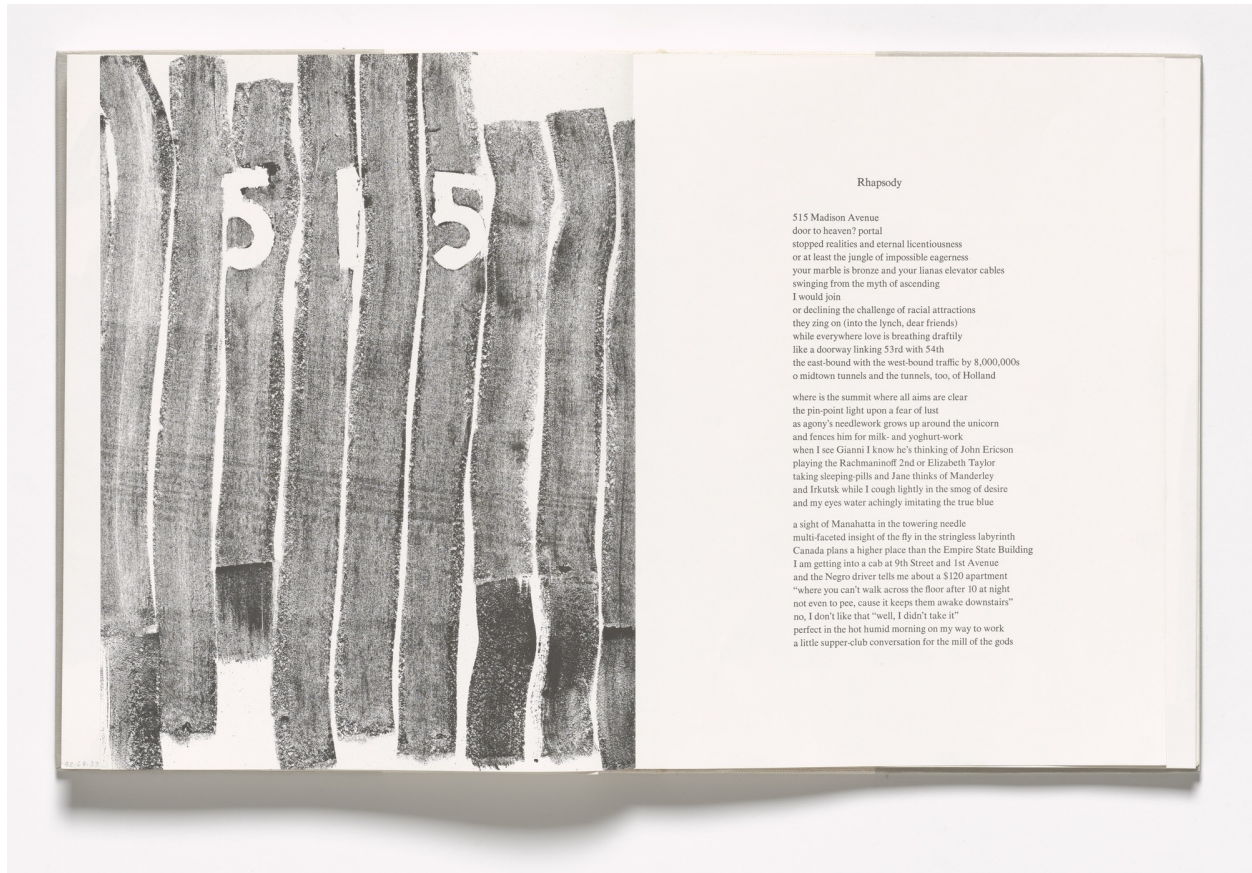
Frank O'Hara, "Rhapsody," illustrated by Michael Goldberg, from In Memory of My Feelings , 1967