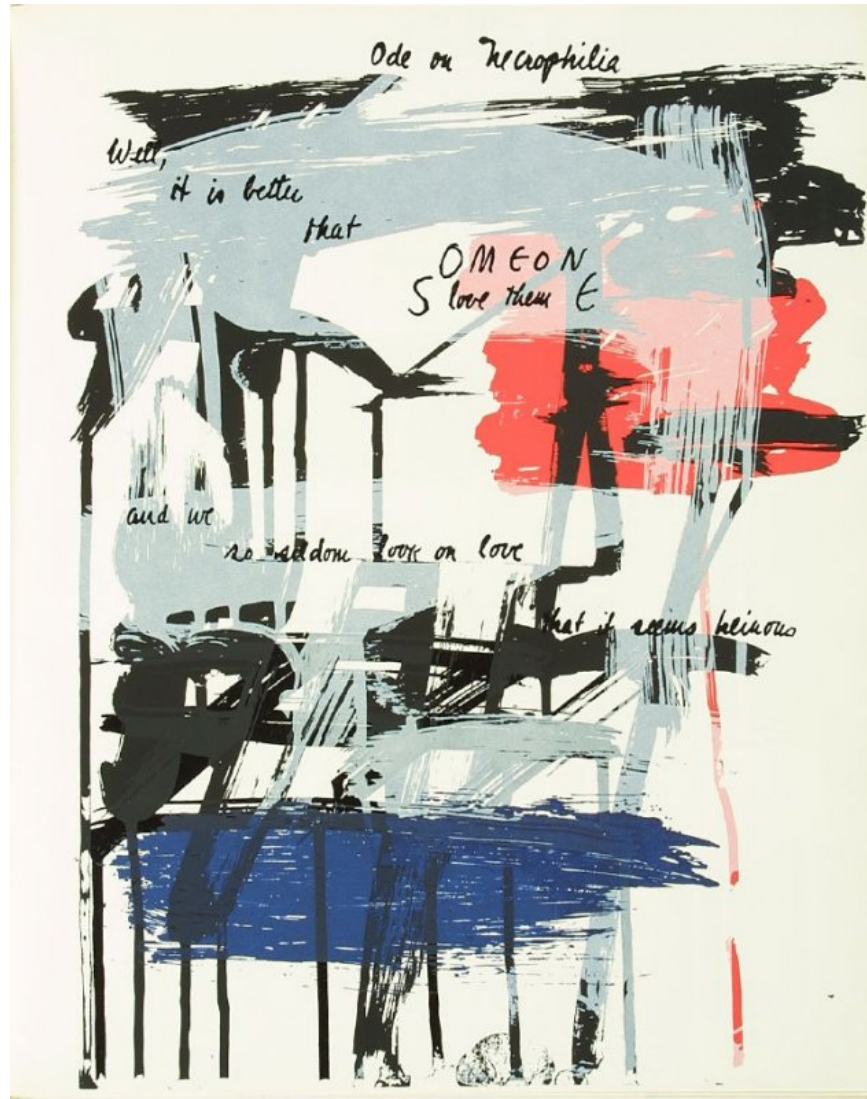
Michael Goldberg & Frank O'Hara, Ode on Necrophilia , 1960