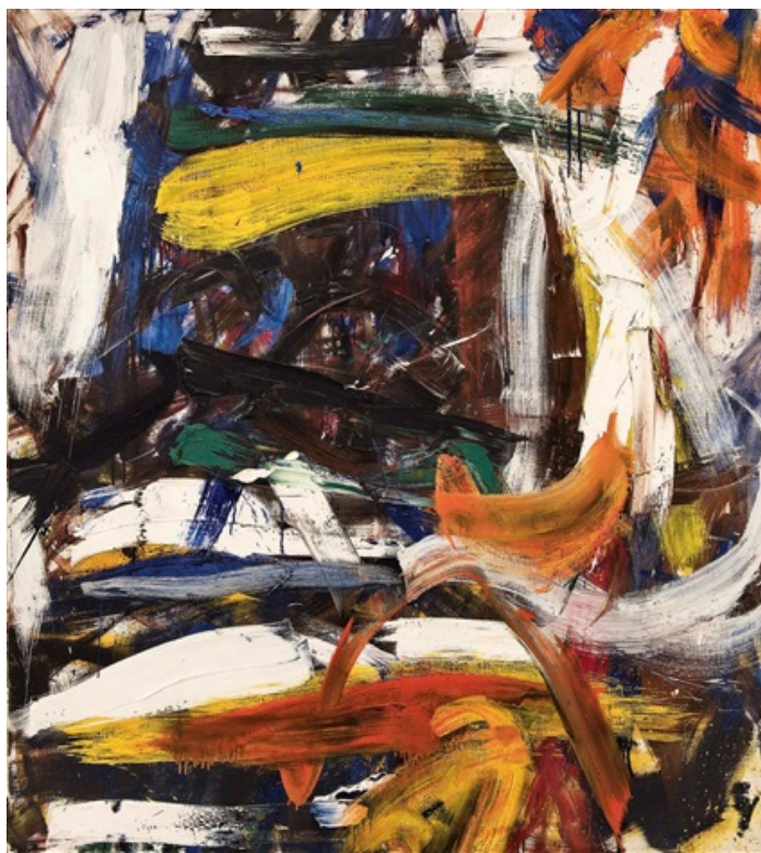
Michael Goldberg, Dune House I , oil on canvas, 1958, 60.5 x 54.25 in.