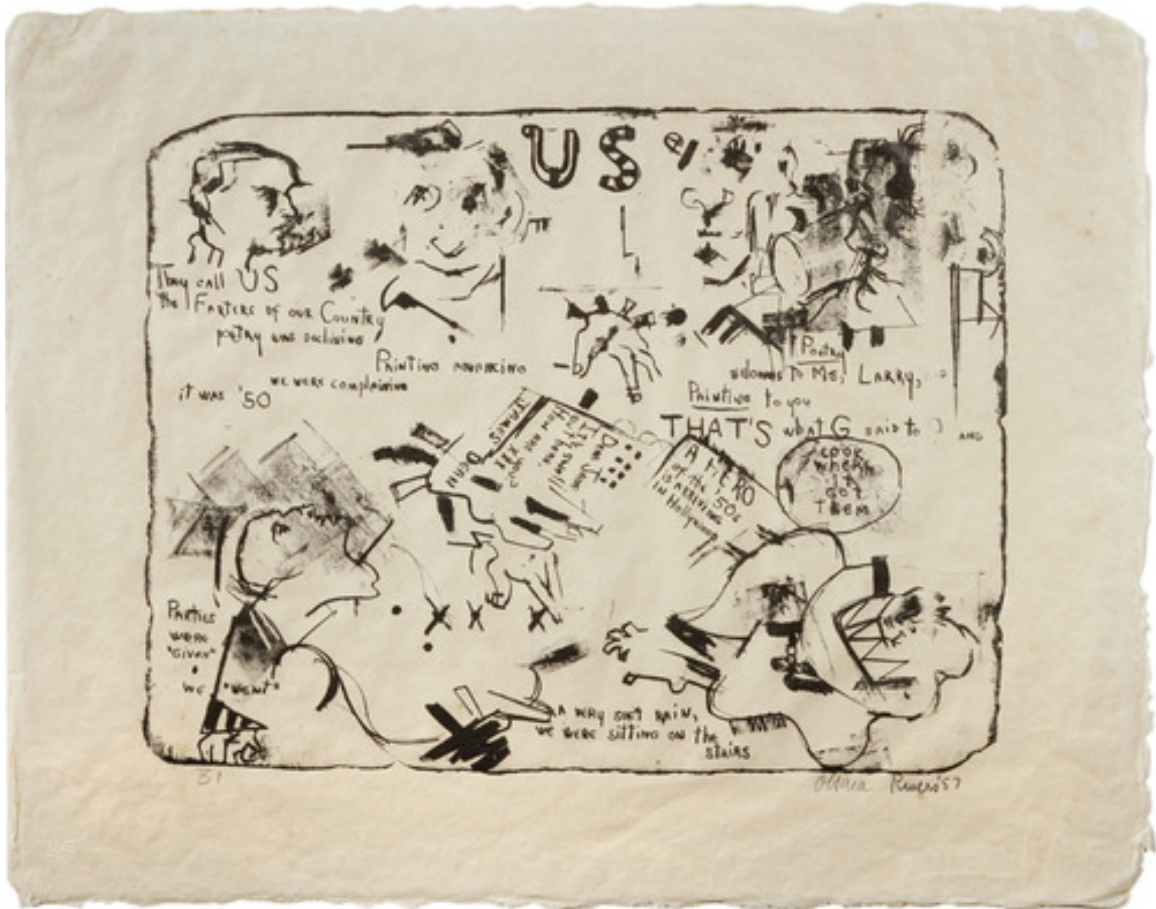
Larry Rivers & Frank O'Hara, US , from Stones , lithograph, 1957