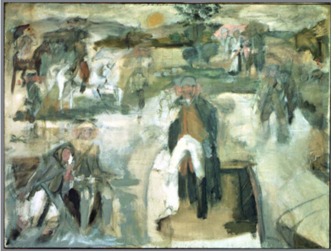
"Washington Crossing the Delaware", 1953. Copyright © Larry Rivers Foundation

Larry Rivers, Washington Crossing the Delaware , oil, graphite, and charcoal on linen, 1953, Museum of Modern Art