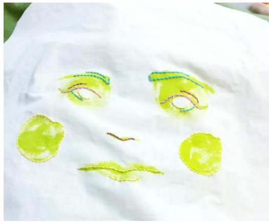
(Fig. 10) DollHouse - Green Doll Mask

The first and most important part of this installation is the mask with its recording. The masks alone are a heavy driving factor in many of the important ideas that I elaborated upon earlier in this text. A mask has the power to strip someone of their identity, allowing them to be dehumanized, or to blend into a collective. In essence, this show pivots upon the mask's ability to do both. When the viewer adorns the mask, they are no longer themselves. This gives them the power to act without consequence, to justify actions they could not take as an individual identity. Again, this has two sides. This power can be used to overthrow corrupt systems, to question the status quo, to stand as one with others. It can also be used to strip a person of their abilities, to force them into submission, to take away their autonomy. When we put on masks, we accept and come into the designated role.