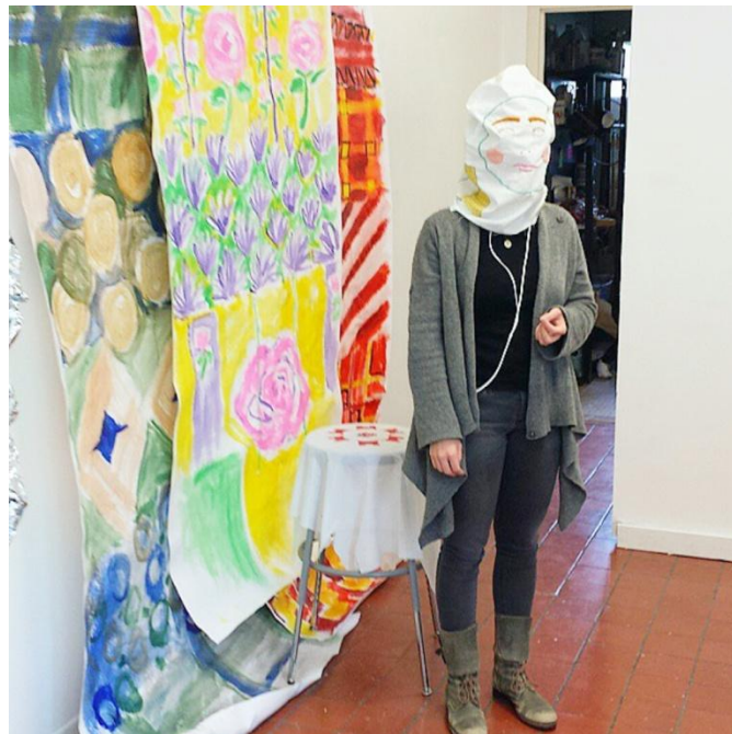
(Fig. 6) It's About Time - Doll Installation

Wurm's work revolutionized the way I imagined viewer interaction. He transforms his viewers into sculptural objects. The parallel between viewer-as-object and woman-as-object struck me instantly as being the best method of conveying how a mask could control the participant. After viewing his work during an installation in SUBmarine Gallery, I went home and wrote the first script for my show: the tea room.