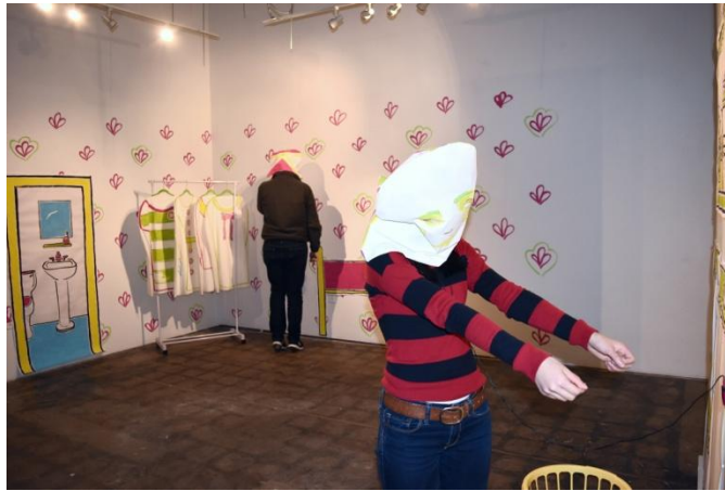
(Fig. 13) DollHouse - Viewer Interaction 5

The recordings, listened to by the viewer from within the mask, take on a very direct role. Where the mask strips you of a former identity, the recordings initiate a new identity. The viewer is first walked through a series of instructions they must follow to properly be incorporated into the doll world by a narrator. These instructions direct the participant to move their bodies in certain ways that mimic simplified homemaking tasks, such as opening the oven, getting dressed, and distributing laundry. The simplification of these actions and repeating them as a series is meant to allude to ritualistic dancing that requires participants to move in specific ways in order to achieve set goals. The movements are meant to be the satirical equivalent of these ritualized dances: the American pop culture version. They teach the moves each participant needs in order to be like a doll.