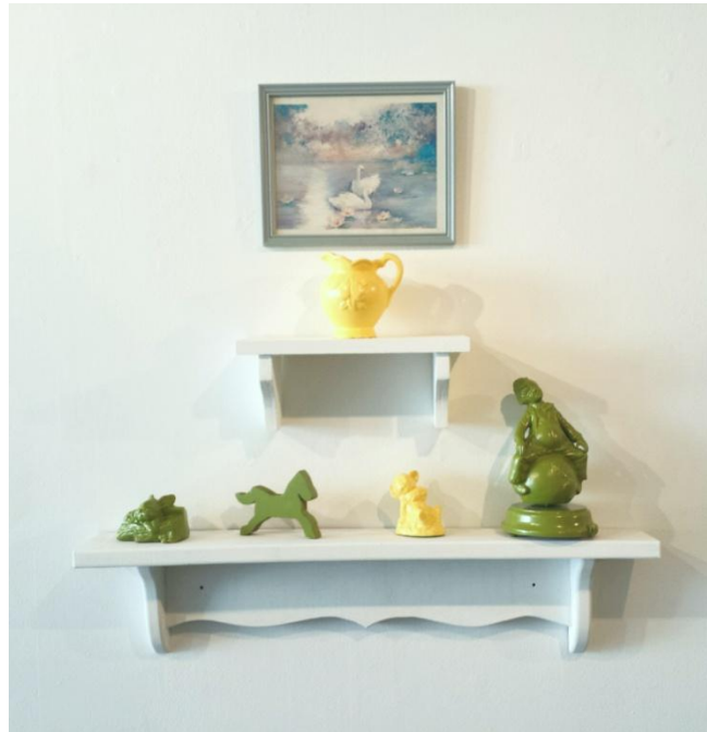
(Fig. 11) DollHouse - Masked Objects

Another way the idea of the identity-stripping masks is used in DollHouse is in the painted objects found throughout the show. Mostly consisting of plastic kitsch items, these objects had personality and bits of information about society within them. By spray-painting them to match the decor of my dollhouse rooms, I stripped them of any identity they had acquired, forcing them to simply match the room.