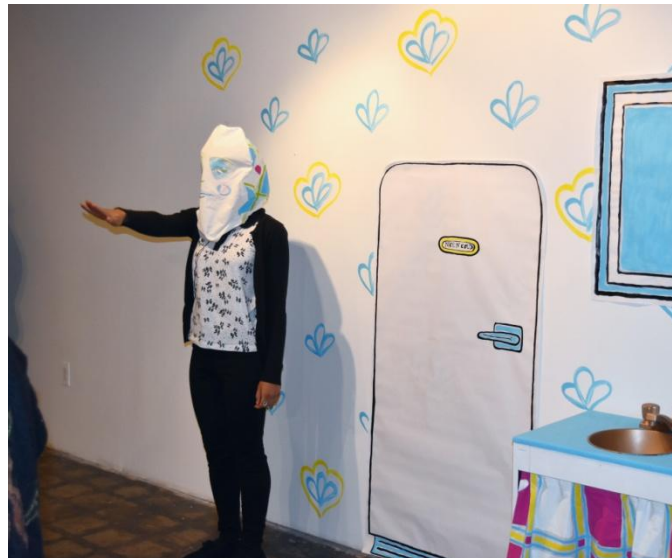
(Fig. 14) DollHouse - Viewer Interaction 1

While the recordings are addressing a lot of antiquated ideals and gender roles, they also highlight how those same issues survive even today. The purpose of the inclusion of these roles is to open up a discussion about how oppressive ideologies still hold sway in our contemporary society (See Appendix A).