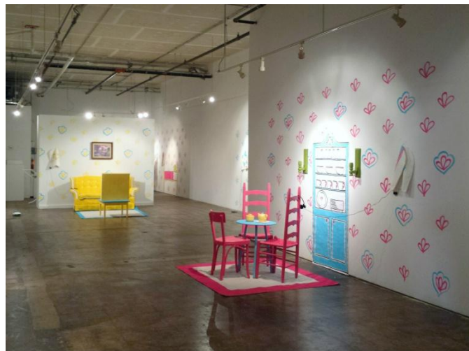
(Fig. 9) The Dollhouse - view of gallery

distribute cleaned clothing. Finally, in the bedroom, they were informed on how to dress and prepare one's self for confronting the outside world. Not only were actions of the viewer controlled with the recording, but also the amount a viewer could interact with each set. In every section there were three-dimensional aspects that the participant could sit on, open drawers, move things around and try things on. However, as with the recording, the viewer was controlled: approximately half of all the furniture presented in the sets was two-dimensional and flat. This inhibited full interaction and stopped the viewer from experiencing full autonomy within the installation: they could only manipulate some of the furniture and decor; the rest was unaffordable and unrelatably stuck to the walls. This also metaphorically restricted viewers from full interaction, the same way stereotypes and social norms stunt the potential of young girls.