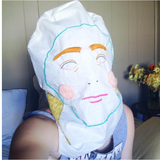
(Fig. 5) Doll Mask #1

cleansing the area. The major ideas I took from this event were those of inviting the viewer to become a participant, eliciting autonomy through the anonymity of the mask, and creating a cohesive visual representation of the goals intended for the event.