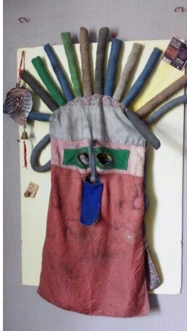
(Fig. 3) Diablo Umo Mask from Ecuador

Donald Pollock, author of “Masks and the Semiotics of Identity”: