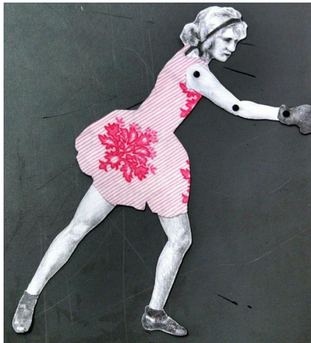
(Fig. 2) Fibers Articulated Doll Exploration

of a dress from Joe Wright's movie adaptation of Anna Karenina (2012). I was interested in how as a child I had several toys that made me predisposed to like or appreciate certain characters or ideas. In this case I wanted to use this story about a woman who had fallen from society's graces by following her heart and forsaking her husband. The adaptation tells the classic story in a wonderfully romanticized way, making her misery and eventual suicide admirable because she was breaking from society's expectations. This is admittedly heavy material for a child, but, once dissected, most children's toys convey very meaningful and ideologically driven information.