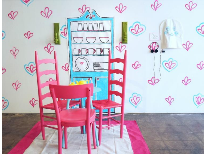
(Fig. 8) DollHouse - The Tea Room

As a viewer entered the gallery, they were presented with an invitation: a statement on the wall inviting interaction and a table set for tea. Nearby, a mask with an unwavering smile was hung on the wall, fixedly staring down those who approached. The scene was decorated with bright pink and blue. A set of headphones with an MP3 player and a sign that read “Play Me” beckoned the audience to listen. If a viewer were so bold as to put the headphones on and press play, they were instantly serenaded by cheesy elevator music, and, after a few moments, a voice welcomed them and asked them to put on the mask. The voice paused to allow awkward fumbling and maybe a little bit of talking themselves into doing it. Then, the participant was directed through several actions relating to serving and appreciating tea, followed by etiquette advice from a doll herself. Within each section of the show, there was a similar presentation. In the kitchen, participants were instructed on how to bake and clean. In the living room, directed on how to use and respect the television. In the laundry, they were directed how to fold and