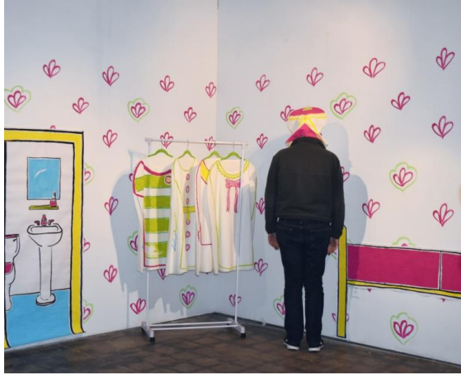
(Fig. 15) DollHouse - Viewer Interaction 6