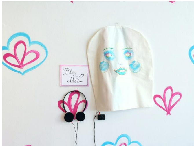
(Fig. 12) DollHouse - Blue Doll Mask in The Tea Room

The masks and headdresses were the beginning of this project: I embarked on an aesthetic investigation into as many different culture's masks as I could find in a short period of time. I arrived at the hood shape of my current masks that was taken from the shape of Russian stacking matryoshka dolls. Then, I refined my search as I polished my making.