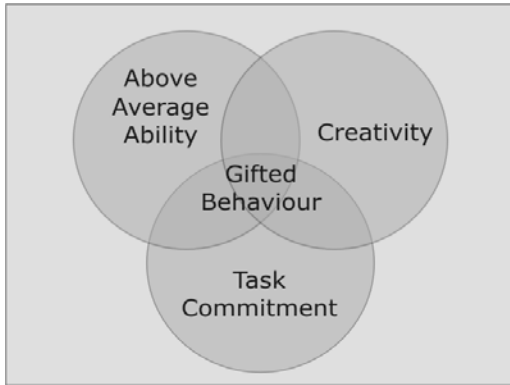
Figure 1. Renzulli's Three-Ring Conception of Giftedness