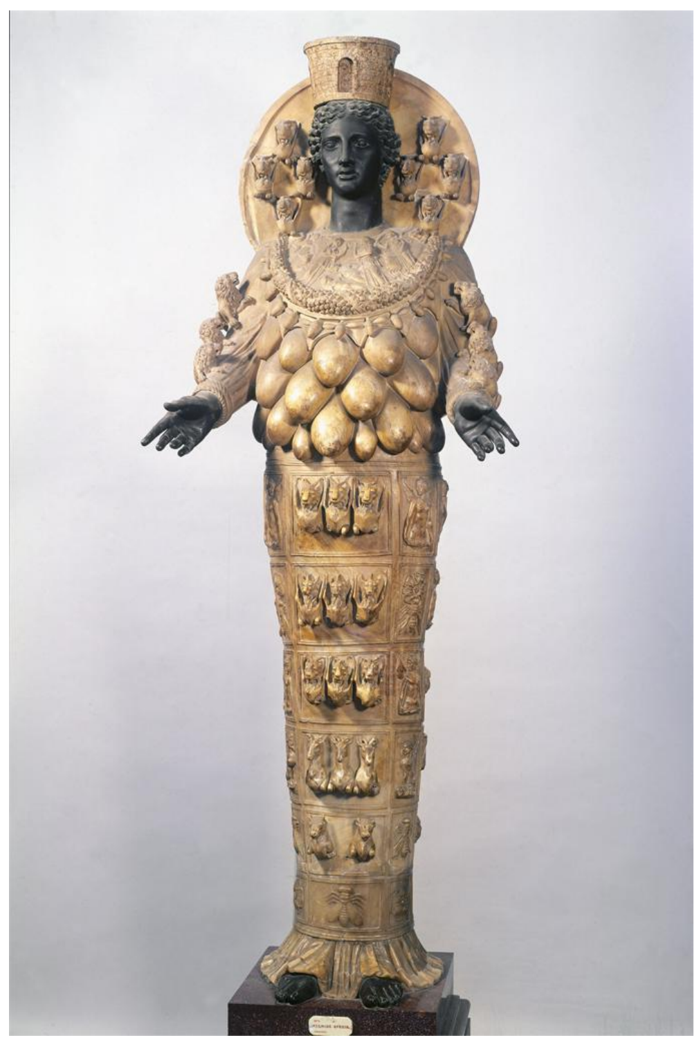
Figure 3: Artemis Ephesia, Roman copy of Greek Original, c. 300 BCE. Bronze, alabaster. Collection of the Museo Archeologico Nazionale di Napoli.