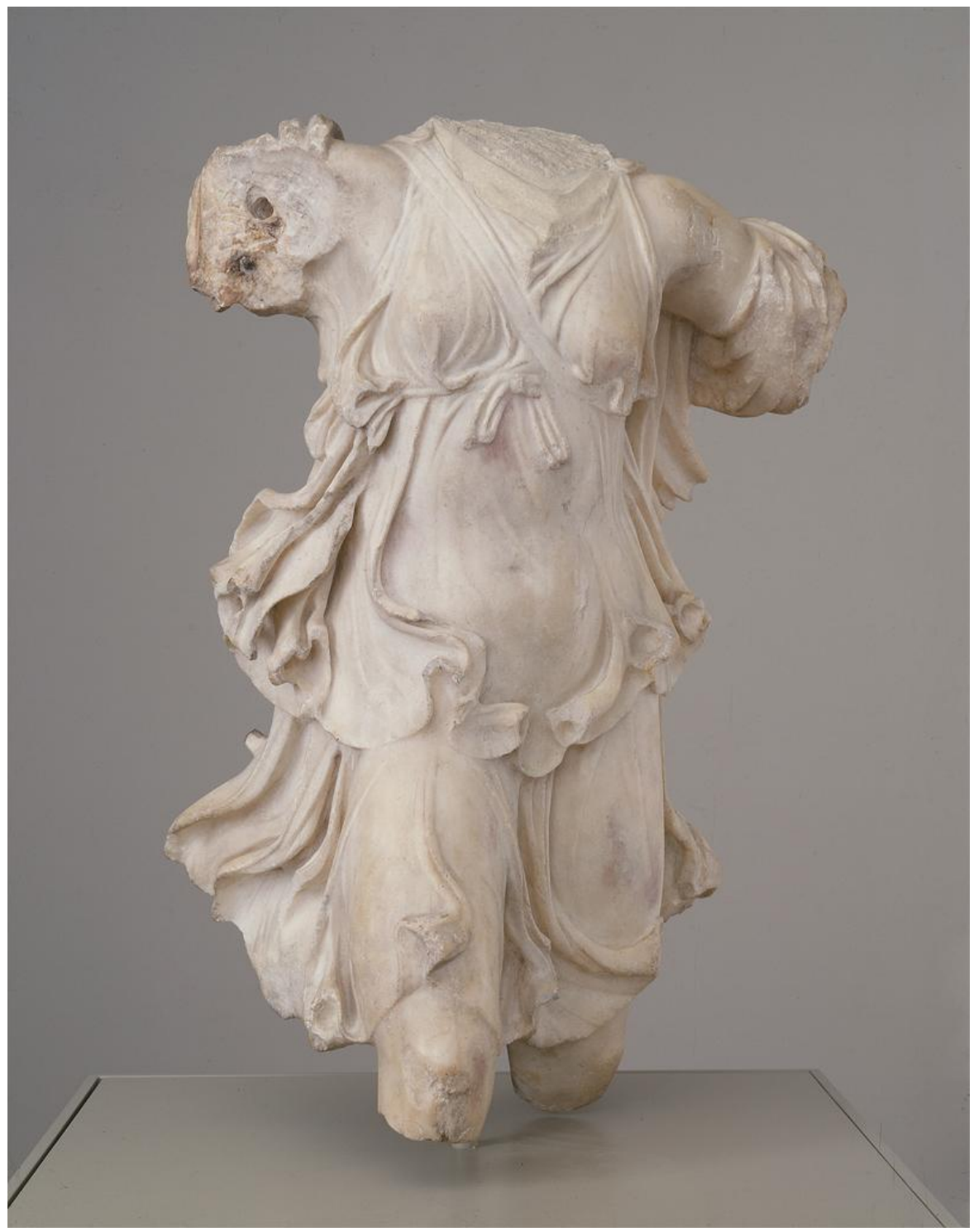
Figure 5: Running Artemis, Greek, late 2<sup>nd</sup> century BCE – early 1<sup>st</sup> century AD. Marble. Collection of the Saint Louis Art Museum.