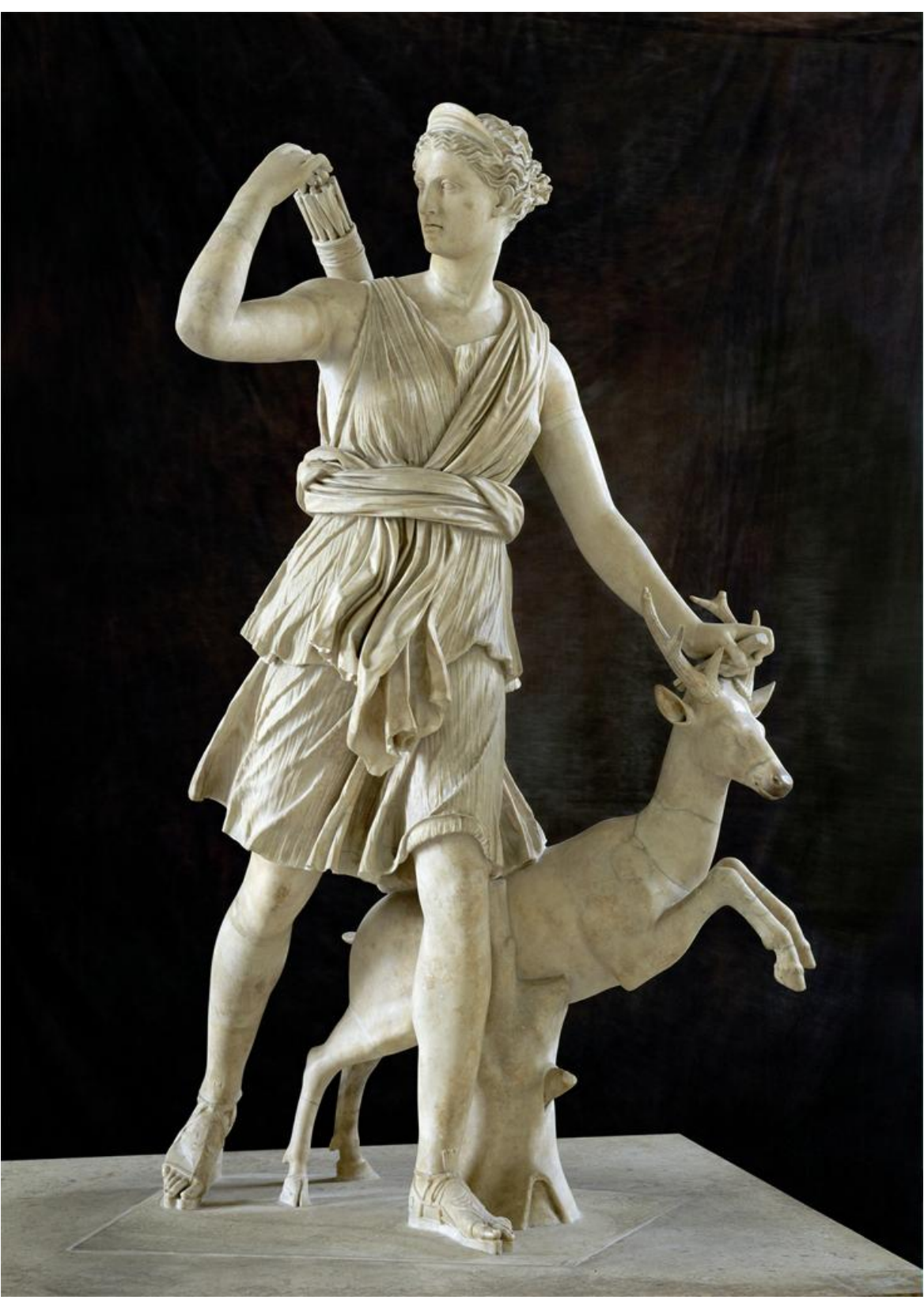
Figure 1: Artemis with a Doe (Diana of Versailles), Roman copy of Greek Bronze original, att. to the sculptor Leochares, late 4<sup>th</sup> century BCE. Marble. Collection of the Musee de Louvre.