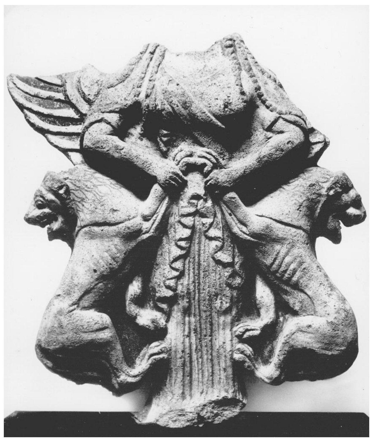
Figure 2: Antefix, Archaic Greek, relief, painted with red and black, ca. 6<sup>th</sup> century BCE. Terracotta. Collection of the British Museum.