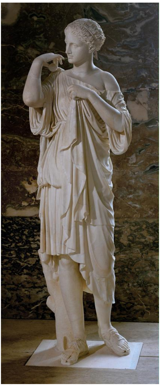
Figure 6: Artemis Fastening her Mantle (Diana of Gabii), Roman copy of Greek original, att. to the sculptor Praxiteles, c. 350 BCE. Marble. Collection of the Musee de Louvre.