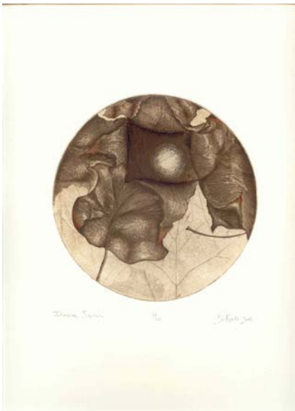
Figure 2: Diversity , 2003, etching, 11x14"

Unfamiliar with the chine colle process of printing an image onto one paper while essentially gluing it simultaneously to another, I experimented with printing the single version of the leaf onto vellum while attaching it to the patterned image printed on copperplate paper. This would prove futile as the pressure of the press would simply buckle the smooth vellum and distort the image. After much trial and error, I discovered that in order to print an etched image onto vellum I would have to add paste to the back side and run it through the press onto paper with more of a tooth than copperplate in order to catch the vellum without buckling it under the pressure. This required the separate printing of the two plates and the attachment of them after they both dried. I then added color with pencils to enhance the pictorial quality of the