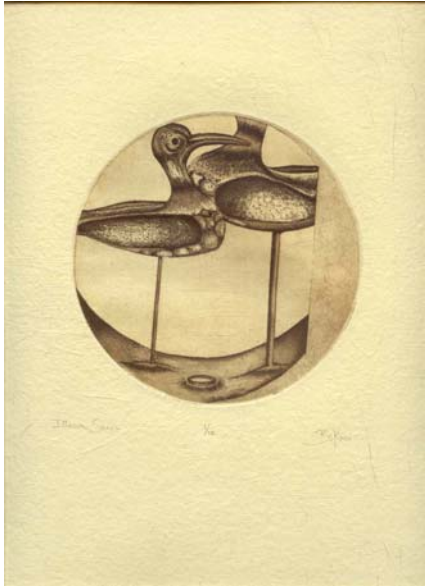
Figure 5: Staked , 2004, etching, 11x14"