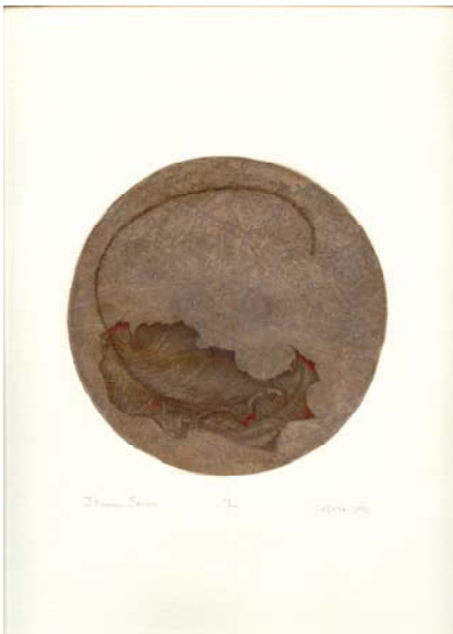
Figure 1: Solitary , 2003, etching, 11x14"

The evolution of Rembrandt's taste and skill with the medium is evident when one views his entire oeuvre in chronological order. The subsequent discussion will provide the reader a stylistic and technical comparison of various etchings by Rembrandt and my six etchings that serve as a visual illustration and personal interpretation of his experimental attitude towards the medium. My six prints are meant to be viewed in groups of three, with two groups making up the entire collection and will be discussed in that order.