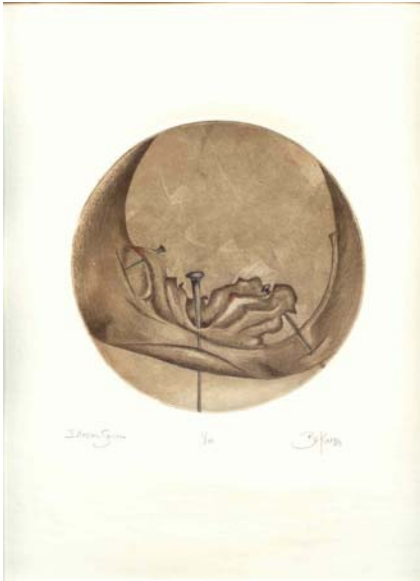
Figure 3: Closing , 2003, etching, 11x14"

The first stage of the process was transferring the preliminary drawing to the plate and etching the outline with a simple line etch. I chose to further complicate the image of the leaf in the second print, multiplying it and forcing the composition to conform to the round shape of the plate, much as Rembrandt conformed his composition to the arched shaped plate of The Raising of Lazarus of 1632.