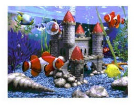
Figure 3. Aquarium Picture, Concept 3a

in alleviating stress in adult and pediatric patients (Carpman et al., 1993; Cintra, 2001; Malkin, 2006; Ulrich et al., 2006). The literature supports that young children chose bright and cheerful colors for their surroundings (Eriksen, 2001; Olds & Daniel, 1987).