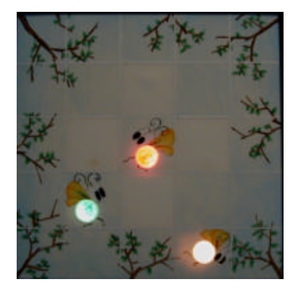
Figure 1. Firefly Ceiling, Concept 1

This concept won an honorable mention award on the national level in the Cooper Lighting Contest of June 2000.