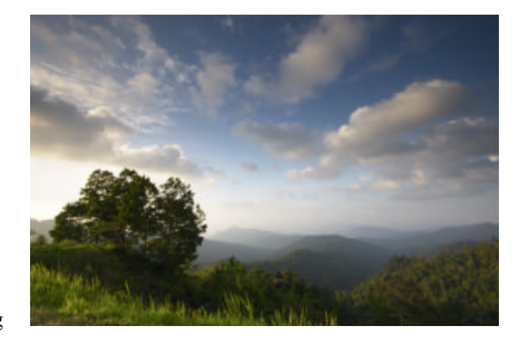
Figure 2. Mountain View, Concept 2

The special preparation entailed using Abode Photoshop to cut the jpeg image of the photograph into six pixel layers with the objects in the foreground (closest mountains and clouds) overlaying