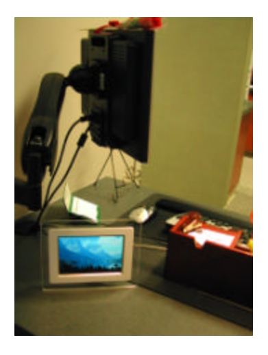
Figure 5 . Receptionist Desk at the Laughlin Memorial Hospital Outpatient Clinic Where Patients View on a Small Computer Monitor the Themes Offered in the Ambient Experience Room.

room. Patients choose an art theme using a small computer monitor located on the receptionist desk (as shown in Figure 5 .). When the patient enters the room the chosen theme is displayed using computers projecting down onto screens installed in the ceiling above the patient's bed (as shown in Figure 6 .). During a tour of the CT facility in July 2007, Mr. Taylor commented, "The patients and staff have appreciated this art. I would like to incorporate it in other rooms."