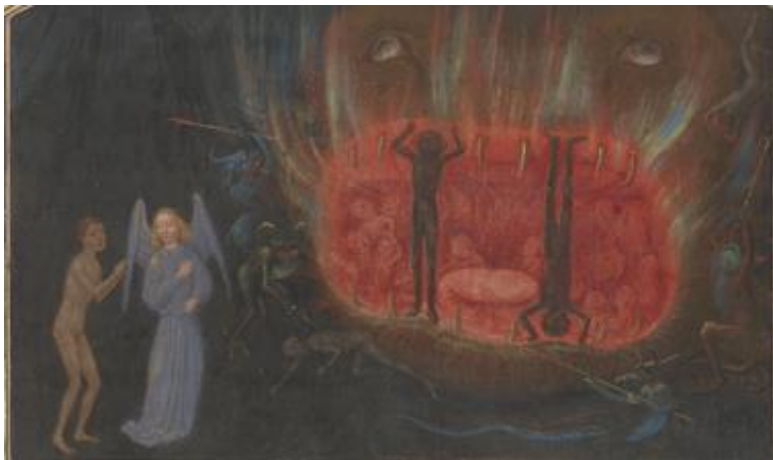
Simon Marmion, Les Visiones du Chevalier Tundal: Acheron , 1475, Collection of the J. Paul Getty Museum, Malibu, California.

those with pride. This image taught the moral lesson of living a humble life. From this, it may be inferred that a Medieval Irish Christian was not supposed to bask in the light of his own accomplishments. It seems more likely that, from the information presented in earlier chapters, the Medieval Irish Christian was supposed to see all of his accomplishments through a spiritual lens. One should not be overly proud of their achievements because it was the hand of God that allowed for the possibility of such achievements. This conveyed a social norm of humility, and Tundale's Vision buttressed this mindset by shocking its audience with frightening imagery.