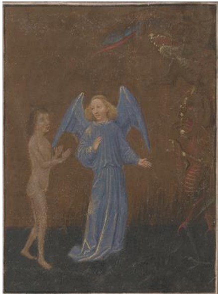
Simon Marmion, Les Visiones du Chevalier Tundal: Entering Hell, 1475 , Collection of the J. Paul Getty Museum, Malibu, California.

As a tale of pilgrimage through the cosmology of the Christian faith, the unfortunate Tundale endured a number of torments that Hell offered. In the progression of Tundale as a character, these torments juxtaposed with their explanations delivered by an accompanying angel reveal the flaws in Tundale's moral character, but as an implicit didactic device they shed light upon what actions were considered proper and improper in late Medieval Irish Christian society. A Medieval Christian exposed to this visionary tale might have been persuaded to think twice about how they behave in the community because they wished to avoid torments such as those