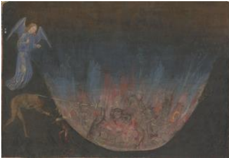
Simon Marmion, Les Visiones du Chevalier Tundal: Forge of Vulcan , 1475, Collection of the J. Paul Getty Museum, Malibu, California.

The last area of Hell that Tundale visited before encountering the Devil himself was set aside for heathens. These people chose to go against the doctrine of the Medieval Church, and because of this, they endured a punishment in a demonic forge called Vulcan 157 . Demonic