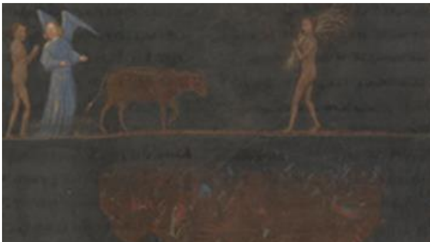
Simon Marmion, Les Visiones du Chevalier Tundal: Thieves , 1475, Collection of the J. Paul Getty Museum, Malibu, California.

After witnessing the punishment for greediness, Tundale bore witness to the punishment for thievery. Thievery was another act that could greatly damage the success of a Medieval community. Because much of Medieval civilization lived in a perpetual state of change and invasion, food and other such commodities were often in short supply. The 12 th century marked a time of reduction in alms giving by Christian monasteries due to a general rise in poverty and lack of resources 149 . This meant that many had no access to any sort of social relief system in the event that they had no food or shelter. Someone who stole food from another was considered to be indirectly murdering that person, and Tundale's Vision treats this offense with a tone of severity. This part of Hell contained a lake that dwarfed the sky itself 150 . Large numbers of monsters resided in the lake, consuming the souls unfortunate enough to fall in. In order to cross this lake, souls had to, once again, cross an incredibly narrow bridge. This particular bridge,