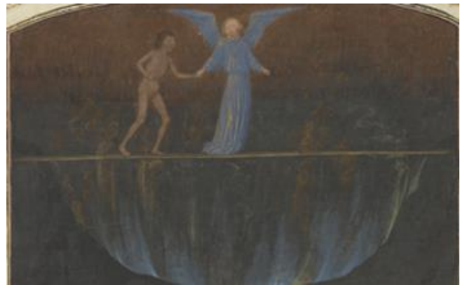
Simon Marmion, Les Visiones du Chevalier Tundal: Proud , 1475, Collection of the J. Paul Getty Museum, Malibu, California.

After addressing the issue of treachery, Tundale proceeded to the plane of Hell reserved for the proud. This part of Hell took the form of a valley shrouded in darkness. The darkness was so thick that it was described as such, “The soul was unable to see anything in the darkness, but he could hear the sound of sulfur flaming and of great