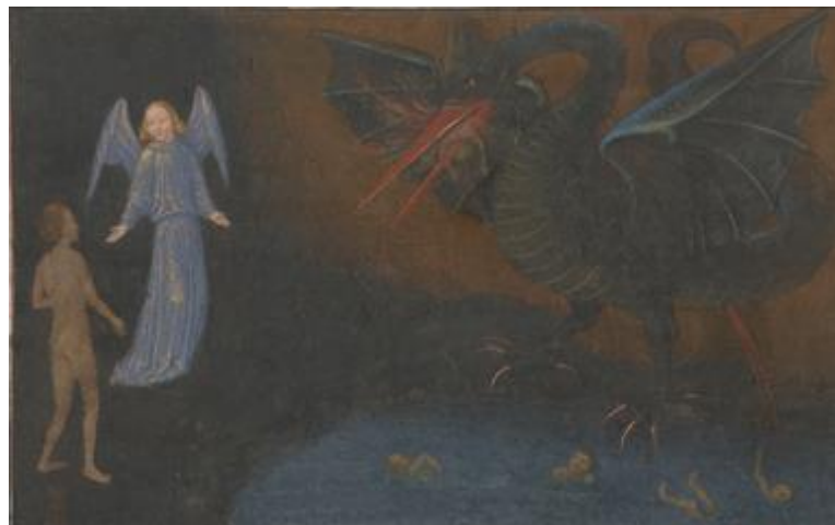
Simon Marmion, Les Visiones du Chevalier Tundal: Unchaste Priests , 1475, Collection of the J. Paul Getty Museum, Malibu, California.

Tundale experienced the punishment for fornication.