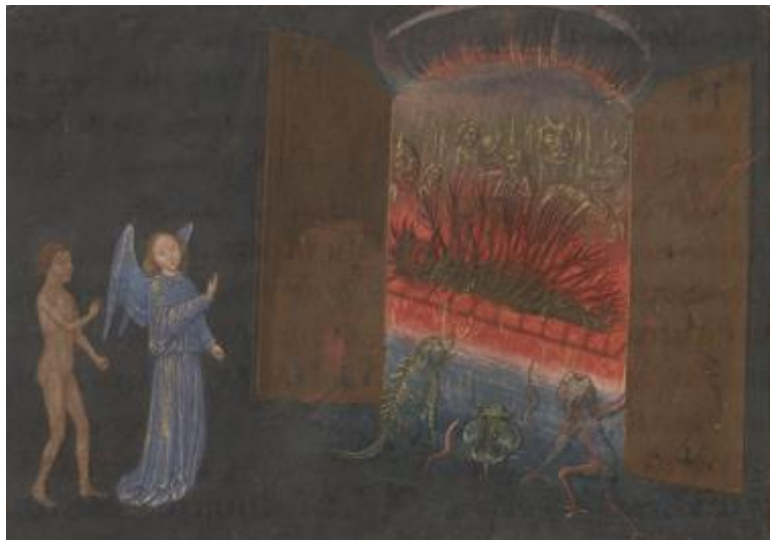
Simon Marmion, Les Visiones du Chevalier Tundal: Gates of Hell , 1475, Collection of the J. Paul Getty Museum, Malibu, California.

with the Prince of Shadows, Lucifer. Tundale's Devil stood with a somewhat human form, but he had black skin, a tail, a beak, and thousands of hands with twenty fingers each 159 . Legions of demons surrounded the Devil as he breathed the souls of the damned into the levels of Hell for which they were bound. He crushed souls of all variations of sin with both his hands and tail 160 . This depiction of the Devil also presented a point of differentiation from the majority of visionary accounts. In other earlier visions, the Devil wielded impunity from the sufferings of Hell, and he sadistically inflicted torments on the souls in his realm. Tundale's Devil, on the