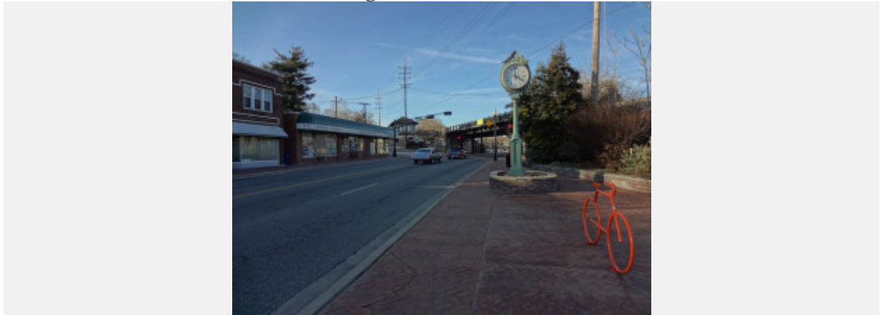
S. Florissant Rd. Downtown Ferguson, Missouri.

We can also ask about what kinds of materials are held in archives and Special Collections libraries. Research libraries have emerged which focus specifically on African-American historical collections: the Schomburg Center for Research in Black Culture in Harlem, a branch of the New York Public Library , is the largest library of this type in the United States. The second-largest library dedicated to African-American historical collections is here in Atlanta: the Auburn Avenue Research Library (currently under expansion), a branch of the Atlanta-Fulton County Public Library is literally just down the street from Georgia State University. Local archives here in Atlanta with significant African-American historical materials, including materials relating to African-American literary figures, include the Atlanta University Center's Woodruff Library Archives Research Center , Emory University's Manuscripts, Archives, and Rare Book Library (MARBL) , the Atlanta History Center , the National Archives Southeast center , and the Georgia Archives . Reference staff at these organizations can provide more information about their holdings of African-American resources.