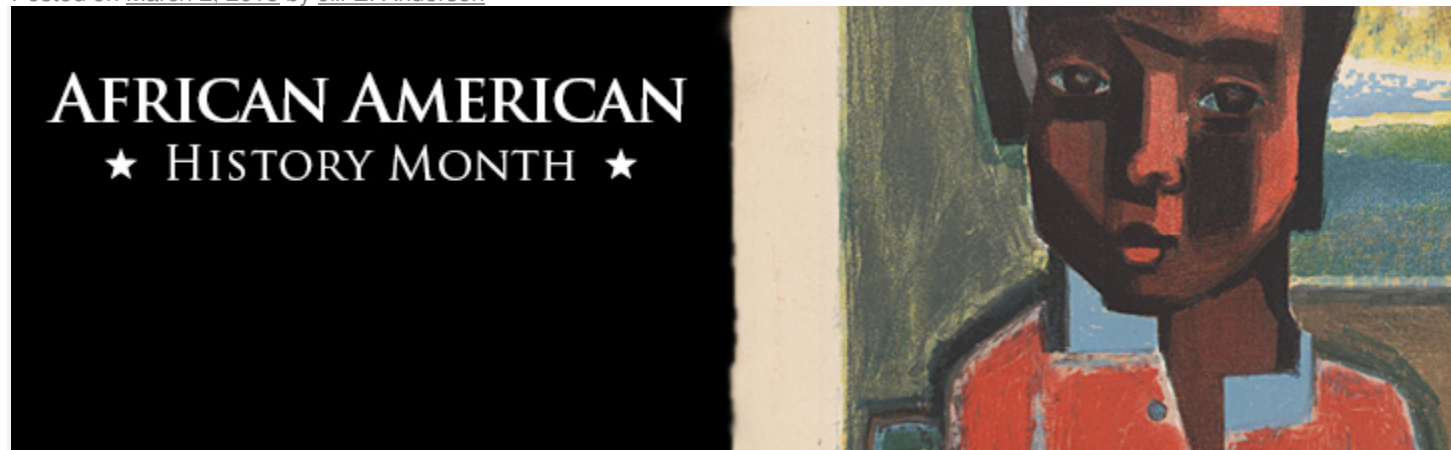
Image from the Library of Congress' African American History Month page