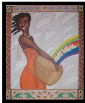
Figure 3.1 Hargro, Brina. Natural Poster. 2010 . Pen and ink on paper. 11x14.”

For my exhibition, I created seven artworks using primarily pen and ink. Three of the works are pictured with below.