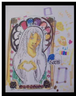
Figure 3.6. Hargro, Brina. Love Thy Hair Poster sketch. 2010. Pen and ink on paper.