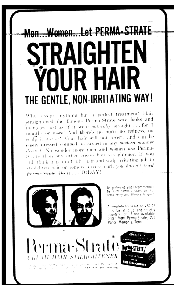
Figure 2.2. Hair advertisement from Ebony magazine.

In Ebony magazine advertisements, hair straightening and skin bleaching ads can even be found during the 1960's. The Perma Strate cream hair straightener advertisement targets both men and women (Figure 2.2). It claims, "Your hair will not revert, and can be easily dress, combed, or styled in any modern manner desired" ("Men Women," 1963, p.178). It also promises to have hair appear as if it were "naturally straight" (1963, p.178) for at least 3 months. This advertisement appeals to the notion that straightened hair has a modernizing effect.