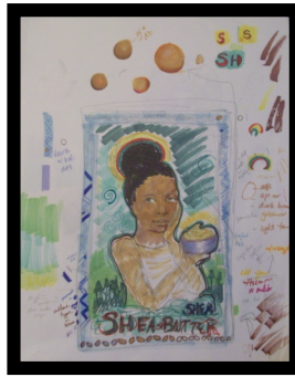
Figure 3.5. Hargro, Brina. Shea Butter Poster sketch. 2010. Pen and ink on paper.