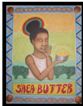
Figure 3.2. Hargro, Brina. Shea Butter Poster. 2010 . Pen and ink on paper. 11x14.”