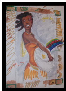
Figure 3.4. Hargro, Brina. Natural Poster sketch. 2010. Pen and ink on paper. 11x14.”

I completed Natural Poster (Figure 3.1) first, then Shea Butter Poster (Figure 3.2), and later added Love Thy Hair Poster (Figure 3.3). All posters were created with Prismacolor or Sharpie markers, using the former predominately. My process was to create small mock up in my sketchbook of each work using pencil and experimenting with layering colors and the layout (Figures 3.4, 3.5, 3.6).