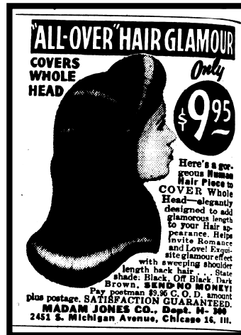
Figure 2.1. Hair advertisement from Ebony magazine.

Coupled with these ads is the previously mentioned practice of skin bleaching. The advertisement is \frac{3}{4} of a page. Half of the advertisement is a light skinned woman gazing at the viewer with a coy smile. She is holding white flowers that touch the side of her face. This image is adorned with the words, “Complexion by Nadinola, fresh as a flower and petal smooth.” Nadinola Bleaching Cream has two products, one for oily skin and the other for dry skin. Underneath the title is two paragraphs about the claims of the product. It tells the reader, “Don’t give in to dark, dull skin! A lighter, brighter complexion can help you become so much lovelier and so much more desirable!” (“Complexion by Nadinola,” 1950, p.14).