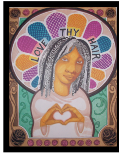
Figure 3.3. Hargro, Brina. Love Thy Hair Poster. 2010. Pen and ink on paper. 11x14.”