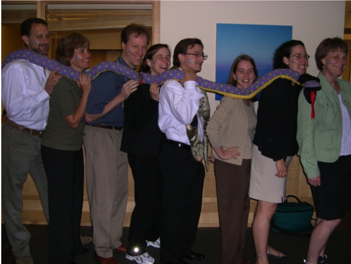
Photo: Members of the leadership council with tattoos and one of their multiple snake mascots.