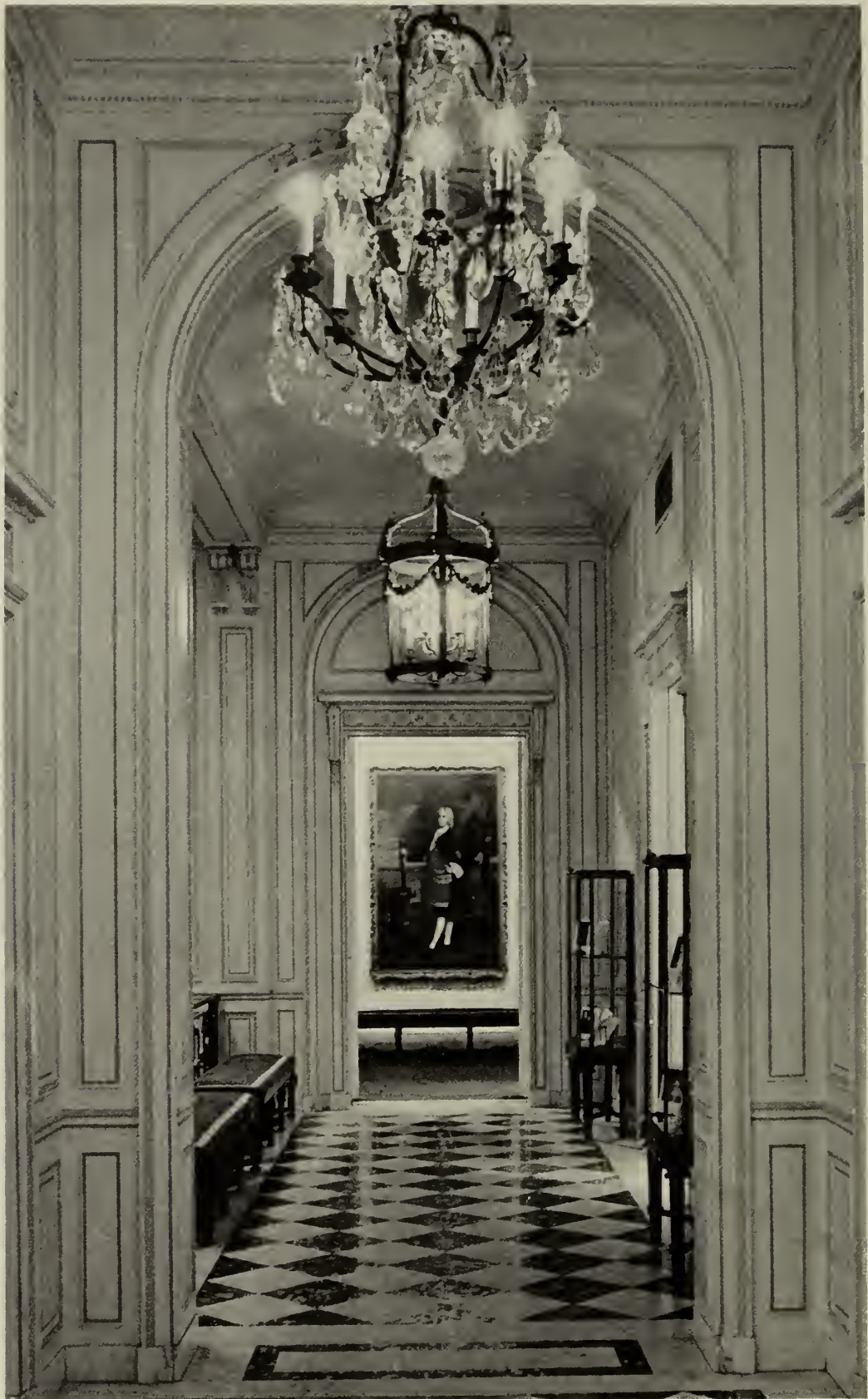
PORTRAIT OF BRIGADIER GENERAL SAMUEL WALDO BY ROBERT FEKE ON DISPLAY AT THE WILDENSTEIN GALLERY