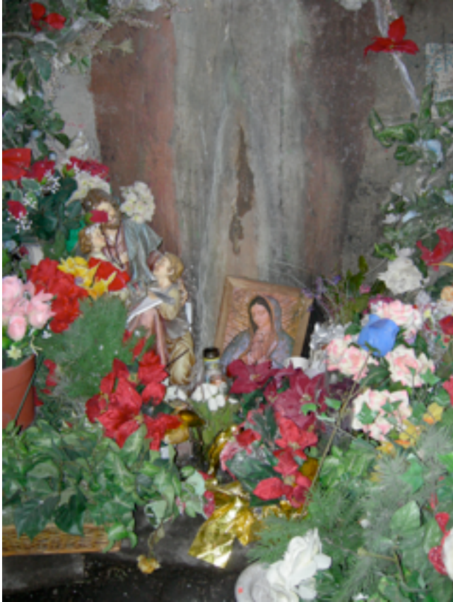
Figure 2 Chicago Underpass Virgin Apparition.