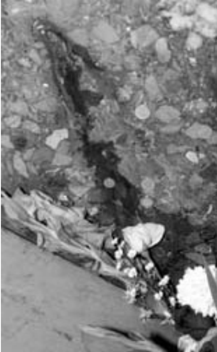
Figure 3 Virgin Apparition in Metro Hidalgo. Mexico City.