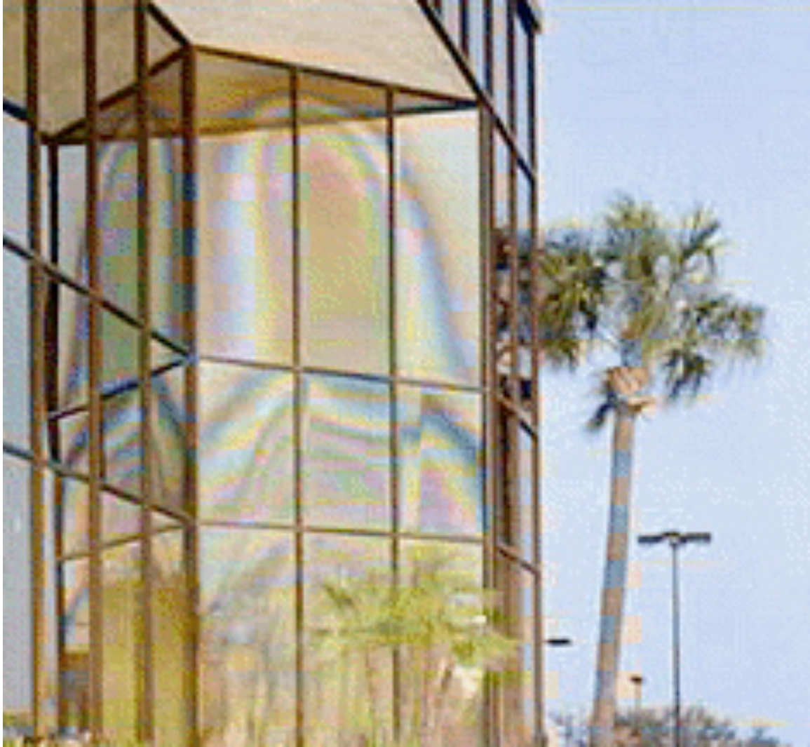
Figure 1. Clearwater apparition.