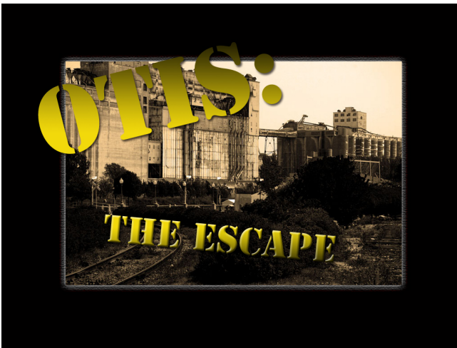
Figure 3: Student game - Otis: splash screen