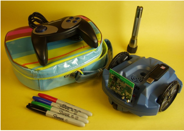
Figure 1: The IPRE Robot Kit, Fall 2007. Clockwise, from top-left: lunchbox carrying case, gamepad, flashlight, Scribbler robot with IPRE Fluke (camera and serial Bluetooth adaptor), USB Bluetooth dongle (for computer if it doesn't have Bluetooth), and drawing pens.