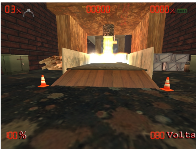
Figure 4: Student game - Otis: screen shot