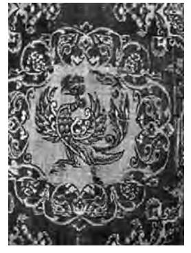
3B Detail of 3A.

attitudes toward foreign places and peoples and the artistic forms that served as their surrogates. This emphasis is dictated in part by the limited evidence documenting the process of the feng huang 's movement to the west, which makes it impossible to arrive at any definitive explanations of the mechanics of its transference. But the approach is also motivated by an abiding interest in what adoption of the feng huang might reflect about Byzantine attitudes toward exotic eastern cultures. This essay operates from the premise that Byzantine viewers' understanding of foreign works of art was embedded in (and can be deduced from) the ways that Byzantine patrons and designers chose to redeploy these models in their own artistic production.