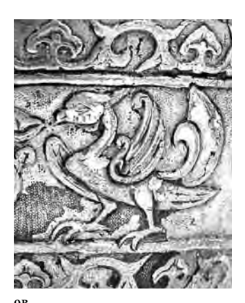
Detail of 9A. From Andersson, Mediaeval Drinking Bowls, pl. 15B

standard vocabulary for the following analysis of the adoption of the feng huang motif in Byzantine works of art.