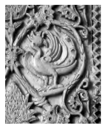
14B Detail of 14A.