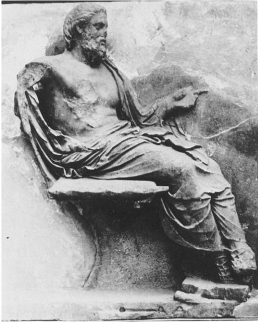
FIG. 1. Athens, NM 173. Seated Asklepios from Epidauros