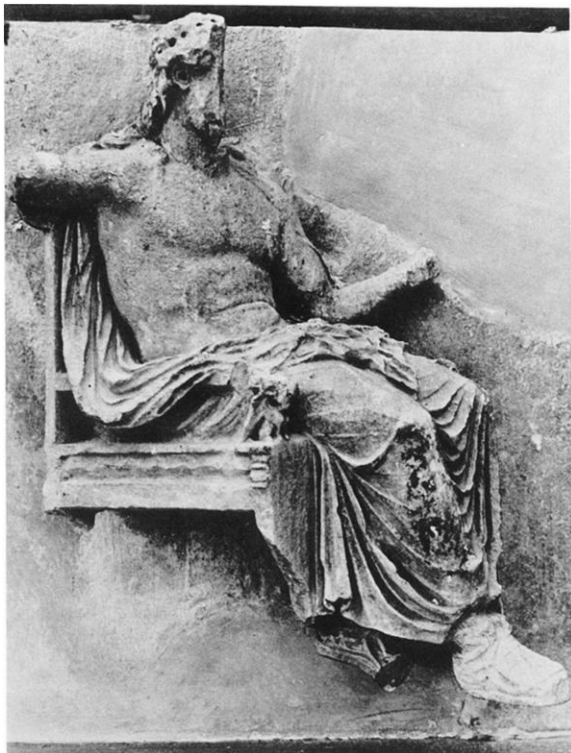
FIG. 2. Athens, NM 174. Seated Apollo from Epidauros