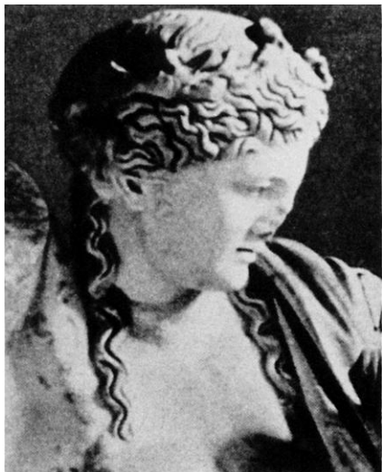
FIG. 6. Apollo from Cyrene, detail