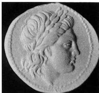
FIG. 10. Coin of Epidaurus: head of Apollo. Reverse similar to fig. 5