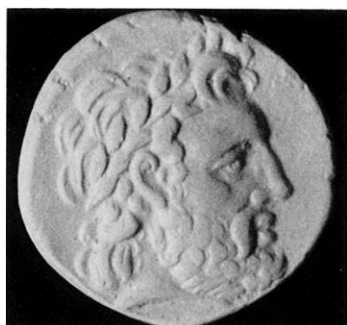
FIG. 9. Obverse of Epidaurian coin, fig. 5: head of Asklepios