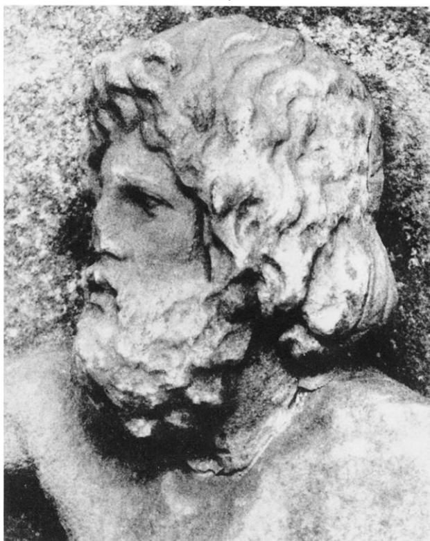
FIG. 8. Athens, NM 1425, detail of base, after Picard, op.cit. (note 27) fig. 11, Asklepios