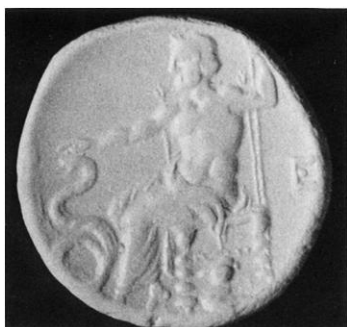
FIG. 5. Coin of Epidaurus, 4th century B.C.