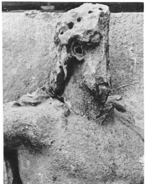
FIG. 3. Detail of fig. 2