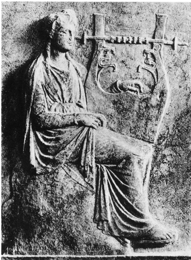
FIG. 7. Athens, National Museum. Base from Mantinea, detail of Apollo