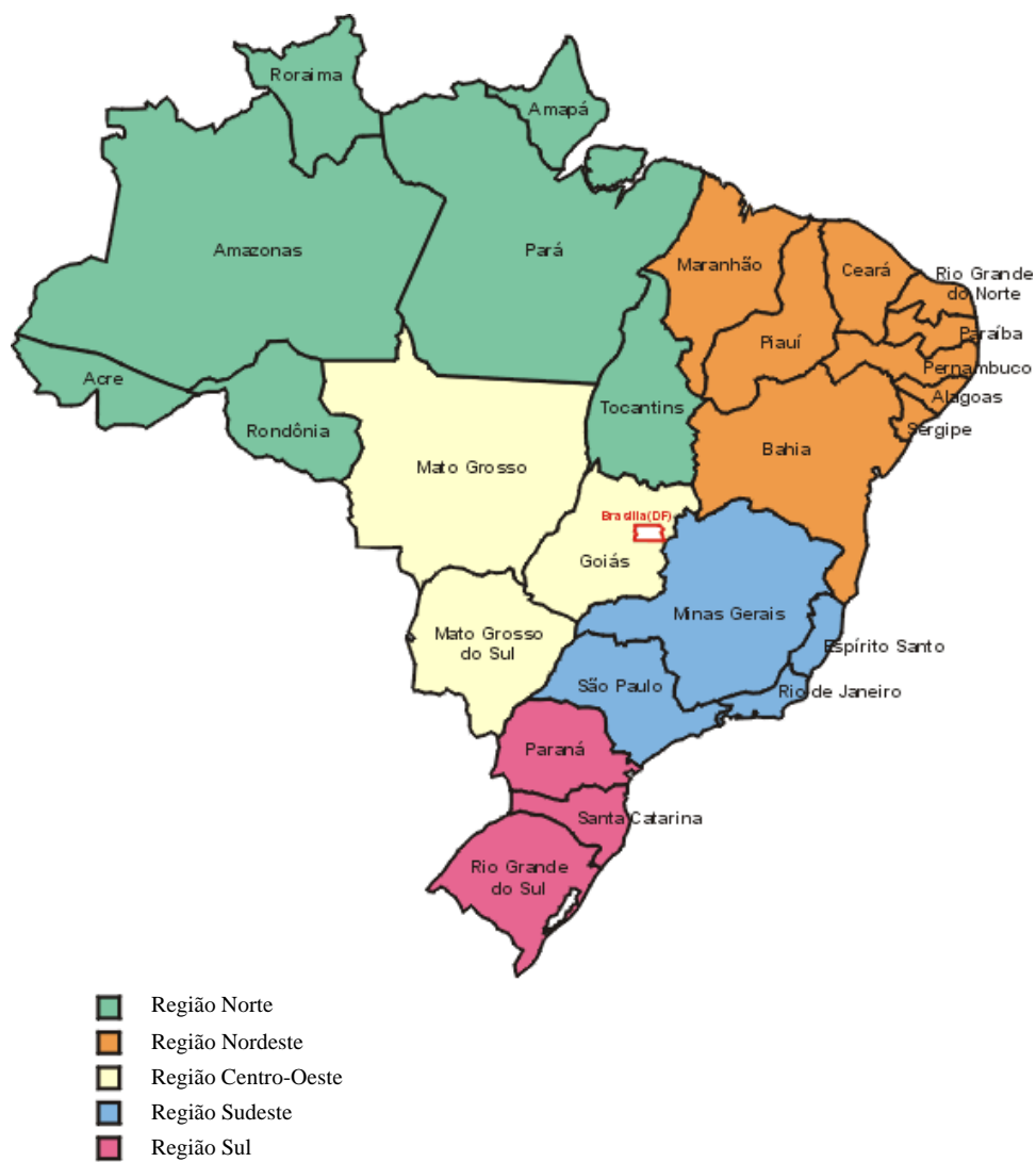
Map of Brazil