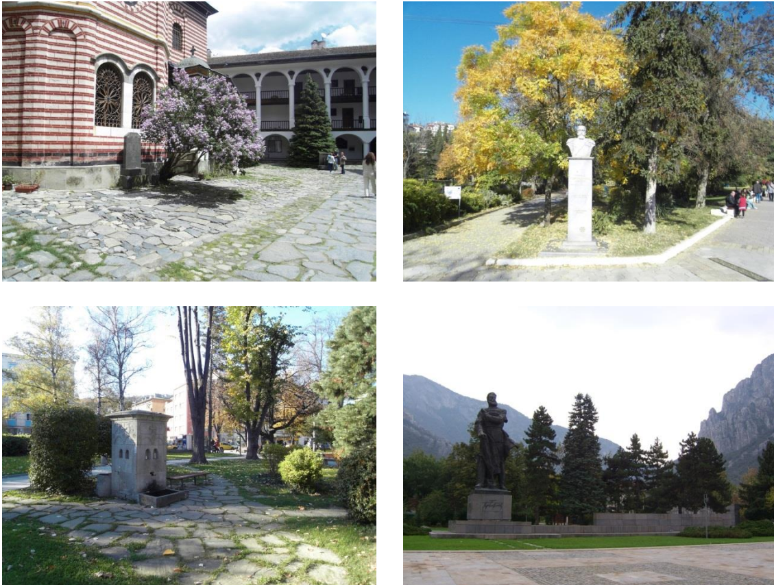
Figure No. 1 Monuments highlighted by vegetation that enhances their effect

In this part of the study are used pictures to comment the impact of vegetation. Through comparisons are presented both positive and negative effects caused by vegetation around monuments. The comments are made of the most common reasons, because it is difficult to systematize some subjective sense of aesthetics.