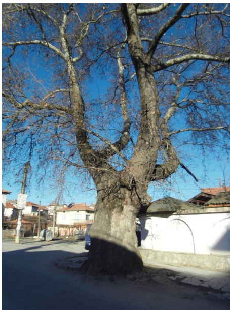
Figure No. 6 Cases where the vegetation itself is a monument

Sometimes the trees themselves or other vegetation act as monuments (Figure 6). They may be old trees in urban environments and even already dead trees, which for decades were symbolic element in the local community and now are left to remind about it. It is appropriate for them to survive for some time while under the influence of natural conditions they rot. In most cases such trees have conservation status, besides being impressive. They are also “witnesses” to past events and therefore have an important historical significance and exist in the architectural framework of central areas or pedestrian zones of cities, making them the undisputed highlight in space. They are often surrounded by decorative pavements but when they are within vegetative areas they should be concisely shaped by flowers or grass.