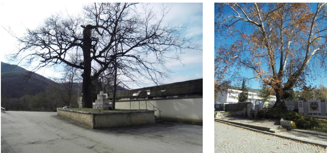
Figure No. 5 Cases where vegetation strongly compete and decreases the impact of the monument

There are monuments that have existed for years and even centuries. In cases where around them is planted lasting high tree (Figure 5), it "outgrows" monument itself and begins to compete with its size and even surpasses it and shifted or hidden from view of the observer. It is recommended in such cases the monument to be moved to a new location, if it is possible. Thus its impact will be restored, and vegetation will be preserved if it is valuable.