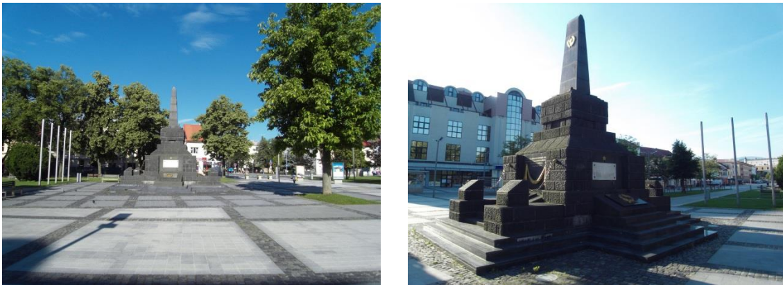
Figure No. 13 Various effects and impacts of the monument depending on the observation distance