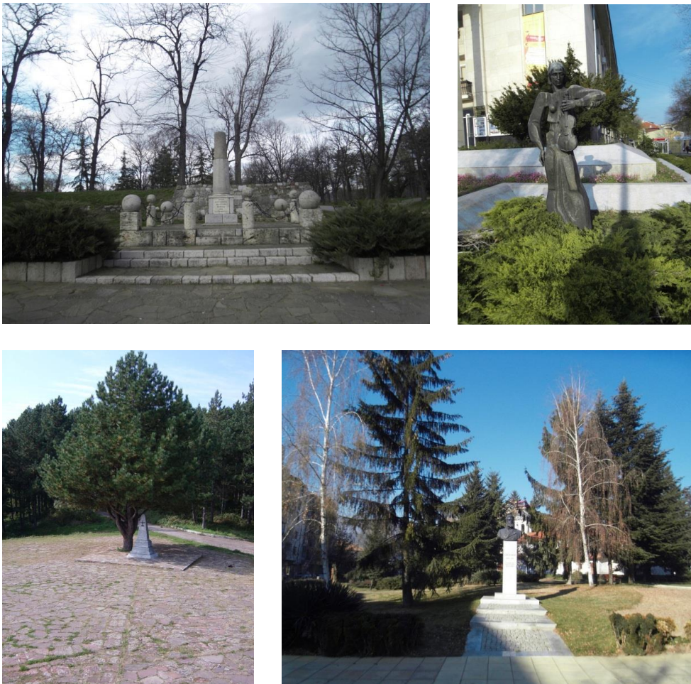
Figure No. 8 The background that monuments stand out is of great importance for their impact