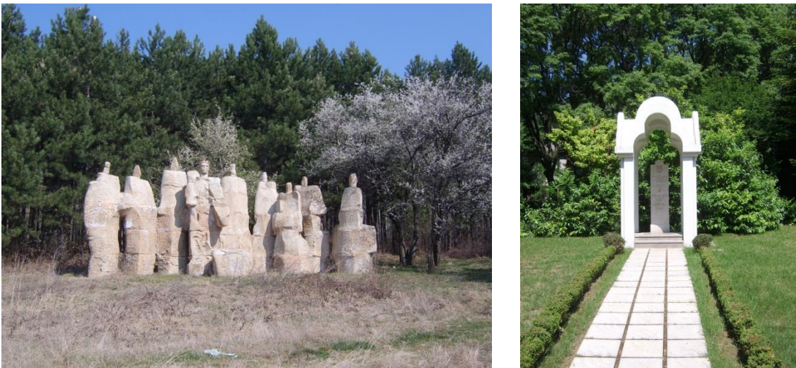
Figure No. 10 Successfully created background of vegetation in front of which convincingly stand monuments and their impact is highly

Figure 10 shows some positive examples of successful backgrounds built behind the monuments. The contrast is basically for a spectacular display of monuments and this is achieved relatively easily, even using the natural vegetation with good knowledge of the morphological features of plants and their phenological events. On the left image a sculptural group is placed in a natural forest environment in the periphery of the meadow and there are some fruit trees. The adjacent picture shows a monument which is situated in a city park.