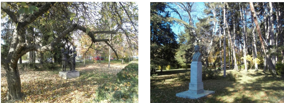
Figure No. 3 Monuments situated but not harbored in the plant environment

In figures 3 and 4 we can see how important the spatial distribution of vegetation in the surrounding area of the monument is. In some cases the vegetation diminishes and "blurs" the architectural volumes of monuments and instead to focus on themselves incorrectly located vegetation distracted gaze or concentrate it in other directions. As seen on the left picture in Figure 3 monuments situated but not harbored in the plant environment do not have a convincing effect because they are "lost" in space and may even go unnoticed by those who pass by them. In the best case, such sculptural elements in a park or forest area appear much smaller than they are and cannot play the role of accents, which is normal for such items. In the case illustrated on the right picture the focus undoubtedly been effectuated, but there does not realized the background, which is required in sculptural figures that would not be seen from behind.