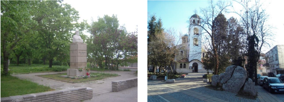
Figure No. 9 Unfortunate created background of vegetation that "fade" the monuments and their emotional impact is small