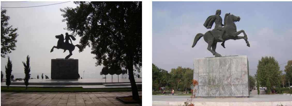
Figure No. 12 Various effects and impacts of the monument depending on the location of the observer

The impact of some monuments depends on the location of the observer (Figures 12 and 13). On figure 12 both pictures show the same monument, but are made from different sides to illustrate various effects and impacts of the monument depending on the location of the observer.