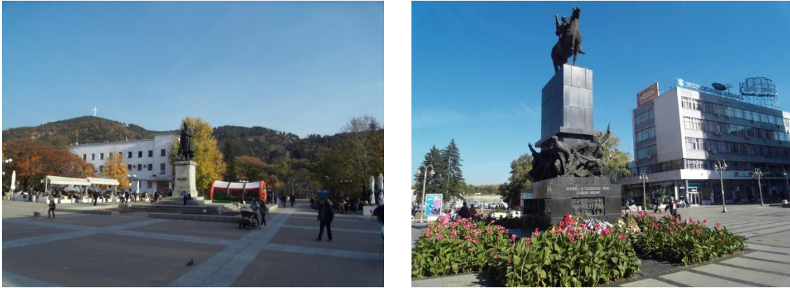
Figure No. 11 A small amount of vegetation sometimes helps to increase the impact of monument

major cities. The presence of a small-vegetation there is greater due to the close distance from which they are observed.