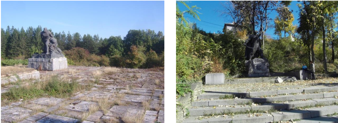
Figure No. 2 Monuments existing in unsupported and neglected environment where inferior vegetation accidentally has come around monuments

Due to the complicated socio-economic and political conditions in Bulgaria many historical monuments lost their importance and are now neglected. Figure 2 shows the negative effect that causes a poor maintenance of their plant environment.