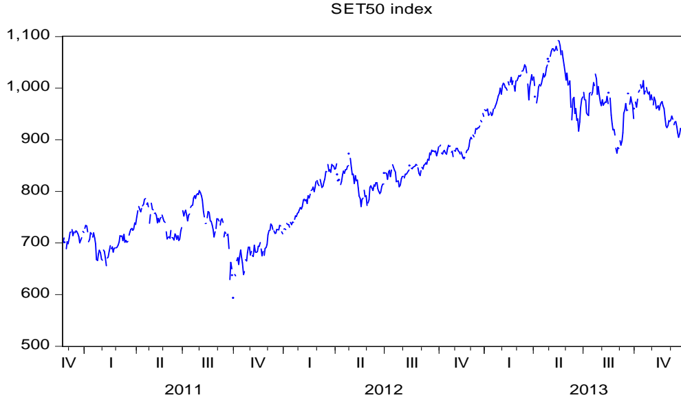
(b) SET50 index series