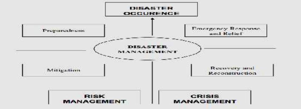
Figure 1.2: Disaster Management Cycle

Source: Disaster Management Cycle (Kawata, 2001)