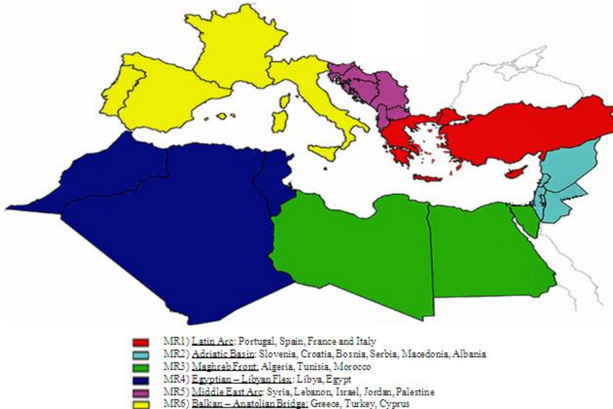
Figure 1 :Mediterranean Countries

Source: Pace G. (2003) Economie Mediterranee Rapporto 2003 ESI , Napoli