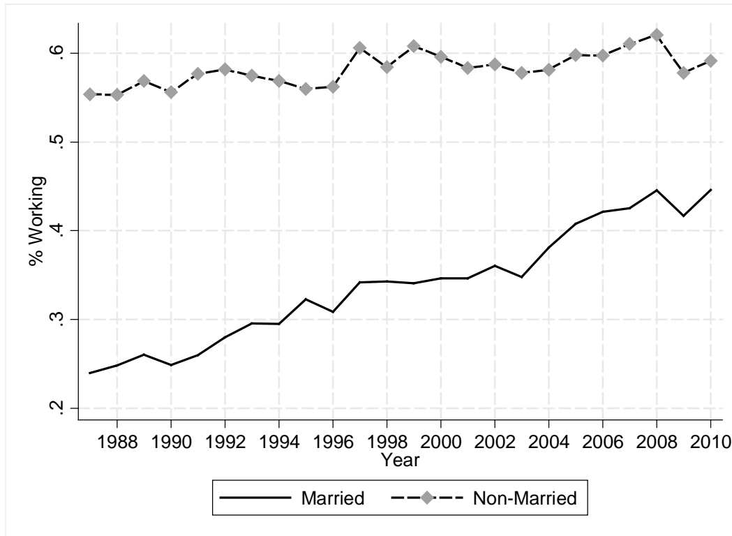
Figure 1. The female labour supply in Mexico.

Notes: Calculations were made by the authors, using Employment surveys in Mexico for females aged 20-60 years old. We use the surveys Encuesta Nacional de Empleo Urbano (ENEU), Encuesta Nacional de Empleo (ENE) and Encuesta Nacional de Ocupacion y Empleo (ENOE). To compare all of the surveys, we restrict the information to urban areas (i.e., areas with more than 100,000 people). The surveys are available at http://www.inegi.org.mx .