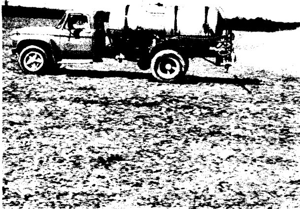
Figure 4.—Spreading a mixture of magnesium oxide and bentonite on grass pastures. PN-4044

(3) Animals can be fed a supplement of special high-magnesium mineral salt blocks or mineral salt mixtures. These are available from feed stores or information on mixing them at home can be obtained from State experiment stations. They often contain dried molasses, grain, or some other material to make them palatable to animals. Also, magnesium may be added to a protein supplement or silage.