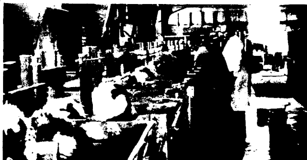
Figure 3.—Studying the effect of diet on magnesium status of sheep. PN-4043

Forage grasses should be analyzed when a grass-tetany hazard is suspected. Forage containing less than 0.2 percent magnesium and more than 3 percent potassium and 4 percent nitrogen (25 percent protein) are especially likely to cause tetany. Forage that is high in potassium and nitrogen should have a magnesium concentration of at least 0.25 percent.