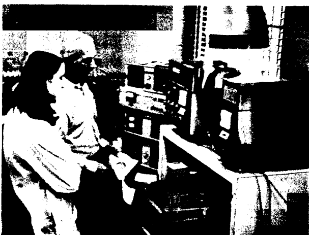
Figure 2.—An atomic absorption spectrophotometer can be used for measuring the level of magnesium in plants, soils, blood, and urine. PN-4042