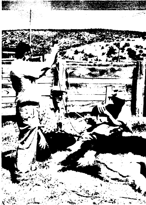
Figure 5.—Injection of calcium-magnesium gluconate into blood-stream of a cow down with grass tetany. PN-4045